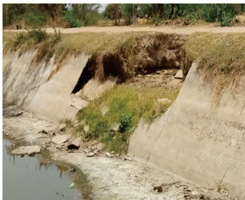
Damaged lining of Moti Fatewadi Canal at ch 10,670 m, Ahmedabad (2 June 2018)

Audit conducted (February 2018/ May 2018) joint site visit of canal system of Fatewadi Canal, Hadmatiya Distributary of Kadana Left Bank Main Canal and Ukai Right Bank Main Canal in which ERM works were executed. During the visit it was noticed that lining was damaged in slopes and bed of the canal at various stretches, structures were either not present or were in damaged condition besides other issues like asphalt roads on service side of the canal not being constructed or vegetation growth and siltation in the canals. Some photographs of the above are given below: