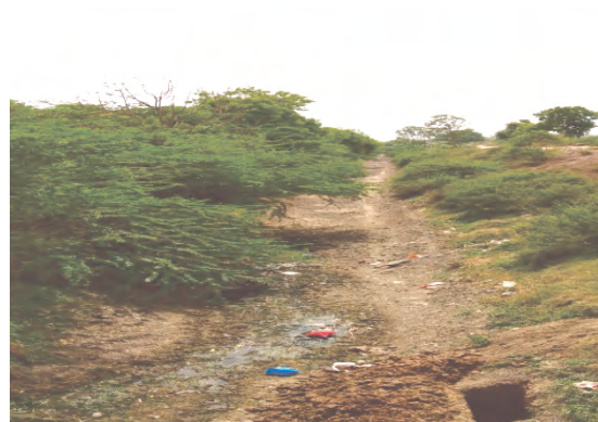
Vegetation in NFC at ch 100-500 m of Fatewadi Canal System, Ahmedabad (2 June 2018)

Audit observed that due to lack of meticulous attention to pre and post monsoon inspections of canals at the Division and Sub-division level, the defects went unnoticed and therefore, no rectification works were carried out. This indicated monitoring of the canal system at the Division level was inadequate.