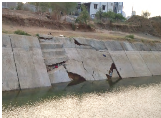
Damaged lining at ch 45,370 m of URBCM, Ankleshwar (15 May 2018)