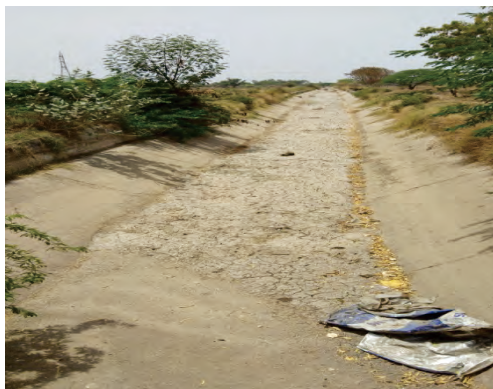
Siltation in extended canal of MFC at ch 10,670 m, Ahmedabad (2 June 2018)