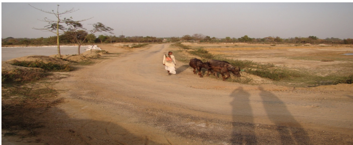
Picture 3: Road under Gramin Sadak Yojana of Rural Works Department, GoJ passing through ash pond area of KTPS

materials and equipments, delayed execution of plant water system and labour problems, etc. were major reasons for delayed COD of Unit # 1, problems in ash evacuation, failure of tube leakage and fire in TG floor etc. attributed to delay in COD of Unit # 2.