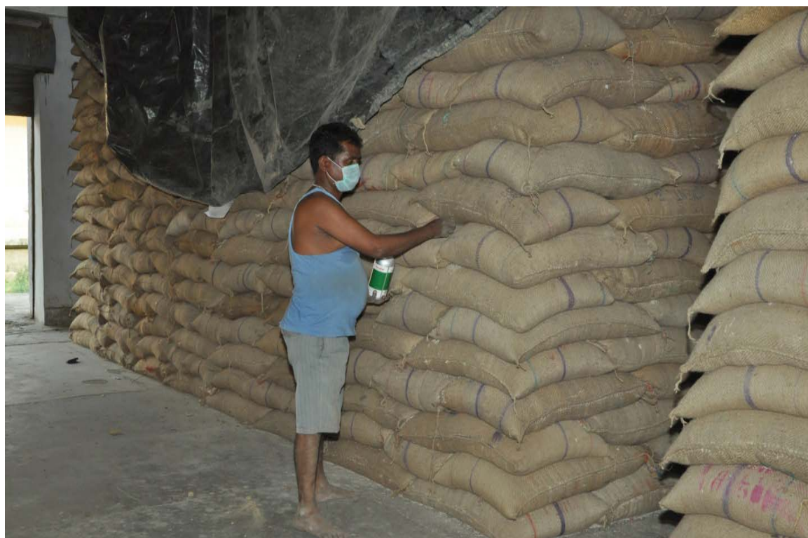
Picture 3.1 Anti-pest treatment

During review of records of Regional Office, FCI, Punjab (2010-11 to 2013-14) and Haryana (2013-14), it was observed that rice stock totalling 1.835 LMT was more than two years old. This was issued during the years 2011-12 to 2013-14. However, no samples were got checked by FCI for the food safety standards relating to toxins, insecticides or pesticides before issue. There was no system in place for ensuring compliance of food safety standards relating to insecticides and pesticides residue as the District and Regional labs did not have any such facility. In absence of a system for ensuring compliance of food safety standards relating to