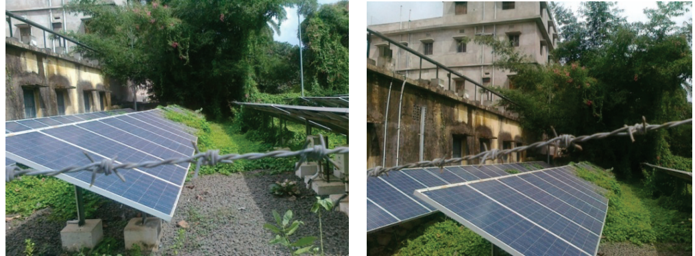
(Solar plates of off-grid Solar Power Plant at Jasidih, Deoghar covered with grass)

During physical verification of three (in Deoghar) out of nine plants we observed that generation of energy from these plants was less than their installed capacity (Jalsar plant: 23 per cent , Jasidih: 13 per cent and DC office plant: 15 per cent ) of 250 kwp due to poor maintenance of these plants. Photographs of poorly maintained solar plates (Deoghar) covered with grass are given below: