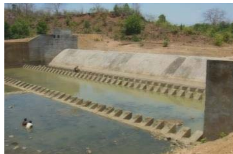
Completed Head Works of Saldih MIP

works were completed with expenditure of ₹ 50.04 crore and the distribution systems were not taken up as of March 2012 due to non-acquisition of land (30 projects), non-finalisation of the ayacut planning of the distribution system (15 projects), delay in finalisation of tender (3 projects) and delay in award of work (3 projects) resulting in the investment of ₹ 50.04 crore not yielding any results.