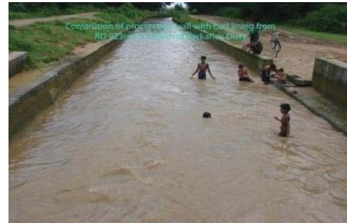
Renovated portion of Hirakud Distribution System

We noticed that the approved plan was deviated during execution. Drainage siphons (25 numbers) and village road bridges (23 numbers) approved for construction were not executed and of the 13.385 km, the Department improved 6.255 km leaving 7.130 km unexecuted and covered other unapproved portion for 17.702 km. In execution of protection wall, of the 15.163 km approved, 9.022 km was executed leaving 6.141 km unexecuted and unapproved portion of 27.488 km was executed. The works were executed in disintegrated manner in patches. The photographs indicate lack of continuous improvement to the canal.