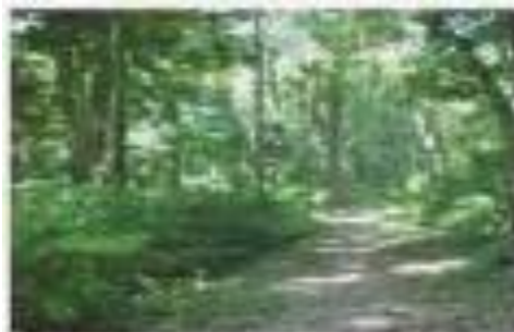
Moderately Dense Forest