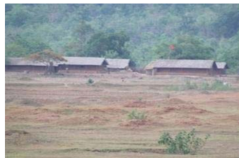
Non evacuation of PAPs from Dam base

was not completed despite an expenditure of ₹ 113.04 crore (April 2012) and no tender for execution of head works was in force (April 2012). The head works was partially completed as shown in the photographs.