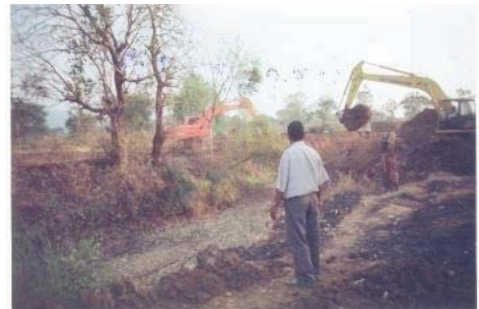
Kusumi Nallah excavation by excavator

We noticed in 13 (three Drainage Divisions 14 ) out of 68 projects sanctioned for ₹ 53.37 crore under tranche XIII to XVII that the EE/SE/CE chose to adopt manual excavation of earth work in drains/