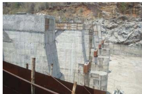
Incomplete Head Works

Phase II of the project sanctioned (2003-04) under tranche IX for ₹ 33.75 crore for providing irrigation potential to 3077 ha kharif and 1750 ha rabi was stipulated for completion in three years (March 2007). The project was incomplete due to modifications in the designs of the spillway and change of alignment of canal/design of structures during execution and non-acquisition of land for the distribution system, with expenditure (March 2012) of ₹ 48.81 crore unfruitful. Further, revised sanction for the increase in the cost of the project was not obtained (December 2012).