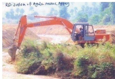
Agula Nallah excavation by excavator

drainage channels in the DPRs (estimates) at rates between ₹ 35.80 and ₹ 68.41 per cum. The works with the inflated costs (excavation by manual means) were put to tender. However, as per the notice inviting tenders, availability of machinery (excavator) required for execution of the work was one of the criteria to qualify for the tender. The works were executed during 2008-12 deploying machinery (lower rate) as shown in the photographs resulting in extra payment of ₹ 6.96 crore of which ₹ 5.80 crore has already been passed on to the contractors.