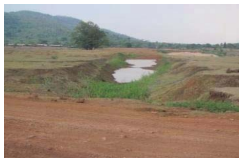
Incomplete Head Works

We noticed that the Ministry of Environment and Forest (MoEF) suggested (November 1990) that rehabilitation plan of project affected families of 21 villages be concurrently implemented and completed before six months of the target date for impounding the reservoir. However, 469 families of six villages only were rehabilitated. Subsequently, Odisha University of Agriculture and Technology, Bhubaneswar conducted socio economic and cultural survey of the affected villages and assessed (2006) that 1220 families were eligible for the R&R assistance. The rehabilitation issue was not solved and the sanction under tranche X lapsed in March 2010. The project