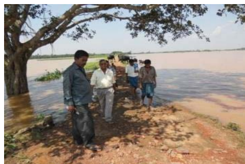
Overtopped Brahmani Left Embankment

We noticed that due to non-raising of the embankment up to a required height including necessary free board together with non selection and inclusion of the projects of weak