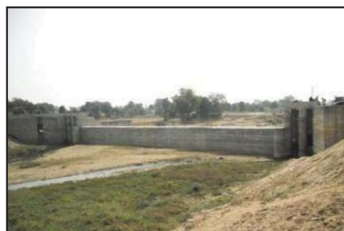
Completed Head Works of Chakramal MIP

Out of 271 minor irrigation projects sanctioned by NABARD for ₹ 335.15 crore, we noticed that in 51 projects sanctioned (tranche XIII-2007-08 and XIV-2008-09) for ₹ 73.90 crore and targeted to provide irrigation to 11783 ha of CCA by 2011-12 only the head