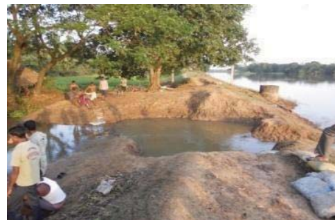
Breach in Double Embankment (right wing)

protecting 94 villages of Aul Block from floods, saline ingress and disposal of rain water and creek irrigation could not be achieved. On the other hand, the flood water of Brahmani river entered in to Double Embankment of the Aul block through the existing 90 metre gap at Rambhila and breached the right wing in two 10 locations for 80 metre in September 2011 causing severe damage in the area requiring restoration with expenditure of ₹ 0.24 crore.