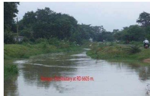
Eroded and unlined portion of Hirakud Distribution System not covered under RIDF

Due to the deviation, the cost of the projects was revised to ₹ 32.74 crore increasing it by ₹ 6.32 crore. The revised cost was approved (January 2011) by the Administrative Department, but the revised sanction of the NABARD was not obtained (December 2012).