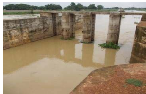
Incomplete Head Works

We noticed that the project was taken up in split up manner. Head works were completed in November 2009, left and right main canals were abandoned mid way (August 2010/January 2011) by the contractors and another reach of right main canal was under execution. The project remained incomplete with expenditure of ₹ 9.13 crore (July 2012). The contracts were not closed and the balance of the works not taken up (December 2012).