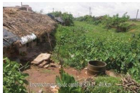
Encroachment inside canal at RD 15.40 Km