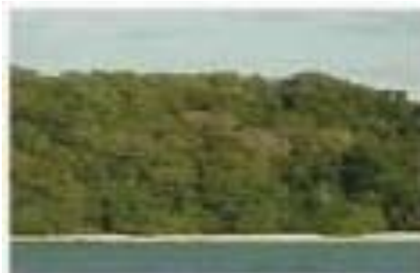
Very Dense Forest

of Forest Report 2011 published by the Forest Survey of India (FSI). Though it was more than the percentage laid out in the National Forest policy, there was decrease in Very Dense Forest (VDF) by 13 sq km and Moderately Dense Forest (MDF) by 28 sq km with increase only in Open Forest (OF) by 89 sq km as per FSI report of 2009 and