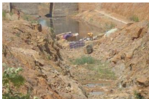
Incomplete Distribution System

The Government stated (December 2012) that the project has been delayed due to non-completion of spillway gate works by M/s Odisha Construction Corporation (OCC) and irrigation has been provided to 600 ha under stage II.