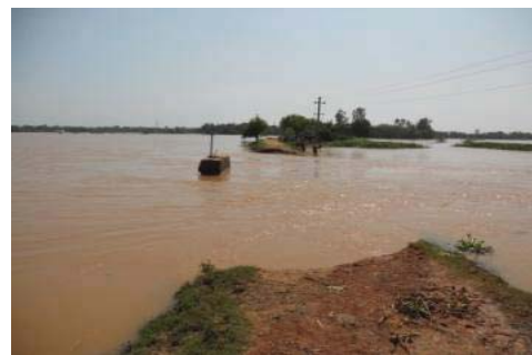
Breach at Gopaljewpatna