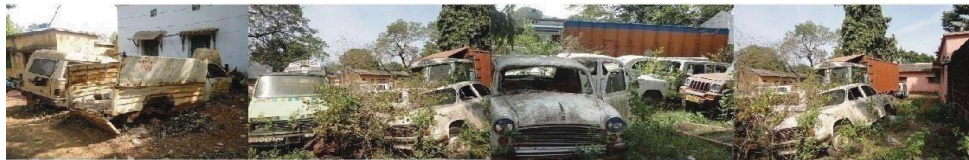
Vehicles seized under forest offence cases lying inside the Range Office campus of Range Officer, Dhenkanal under DFO, Dhenkanal

Thus lack of initiative for timely disposal of vehicles by the departmental authorities led to further deterioration of those vehicles.