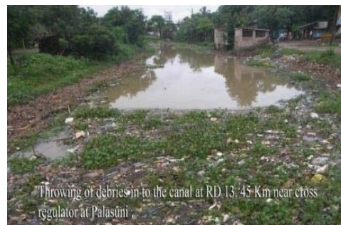
Throwing of debris in to the canal at RD 13.45 Km near cross regulator at Palasuni

The reply is not acceptable since no assured irrigation is being provided through the canal and the canal has been in a distressed condition. The reply is, however, silent on initiation of any action plan for restoration of the canal for stabilisation of its ayacut.