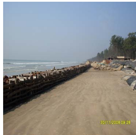
Boulder protection work to protect Geotubes

The Superintending Engineer (SE), Western Circle-II, after obtaining the Government's approval in February 2007, awarded (March 2007) the work to a private agency at a negotiated cost of Rs 3.14 crore for completion by September 2007. As of March 2009 the agency had been paid Rs 3.59 crore after completing work on a stretch of 840 meter only.