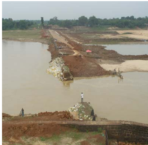
Breached low weir of Anicut after the flood of July 2008

Even though any repair work would be difficult during the monsoon season due to high quantity and velocity of water, the Superintending Engineer (SE), Western Circle-II, hastily decided to undertake two works namely, closure of the breached portion of the anicut and construction of a temporary cross barrier upstream, to divert the river water towards the MMC. The works were awarded (August 2007) to two different contractors for completion by 6 October 2007.