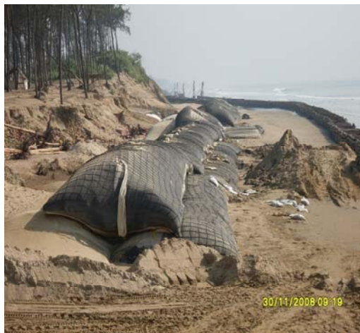
Damaged Geotubes in November 2008