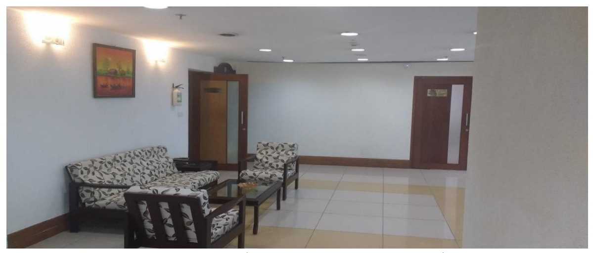
DG RTI's cabin, RTI office on the 5<sup>th</sup> Floor and some area on the 6<sup>th</sup> floor comprise RTI, Mumbai's office area.