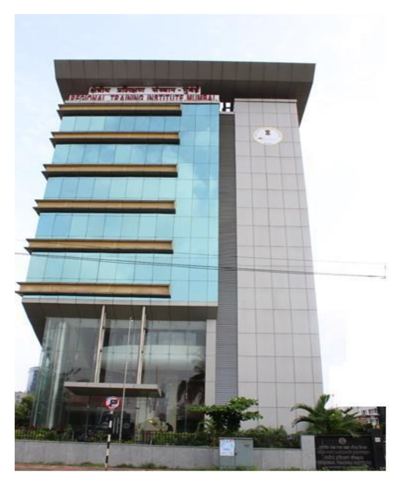
Regional Training Institute, Plot No. C-2, G.N. Block, Behind Asian Heart Institute, Bandra-Kurla Complex, Mumbai-400051