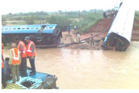
The capsized Delta fast passenger train in Valigonda

rescue work could commence only at 09:30 hours, after the water level receded, with the assistance of the local villagers. The passengers from other coaches helped those in the affected coaches to come out.