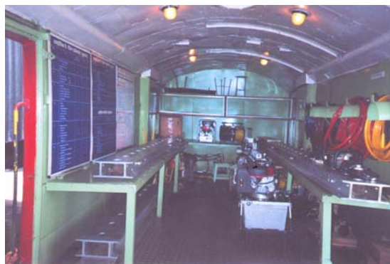
ART Kurla carrying hydraulic rerailling equipment