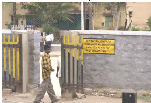
An unmonitored entry/exit point at Bangarapet station