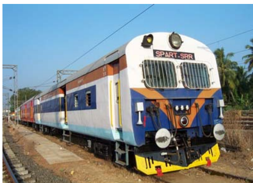
The SPART at Chennai Division