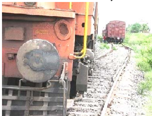
Pathway of ART blocked by a goods train at Talcher Station

In ECoR, the ART placed at Talcher siding could move only in the forward direction and had to take a route, which was invariably occupied by goods trains blocking the exit point of the ART. In ECR, an ARMV was placed at Jhanjharpur and all the staff deployed on this ARMV