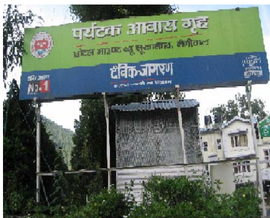
Picture : 7.2.2 Glow Sign Board

In the tourism policy, grandiose ideas had been envisaged to make Uttaranchal tourism a brand name. These included signs in highways, Airports, bus-stands, as well as wide publicity in Electronic media, print media as well as web sites. There were to be seminars as well as fairs highlighting the tourist potential of the state. However this all remained in paper and the Nigam had no policy for publicity which remained confined to distribution of pamphlets at booking centres and TRHS.