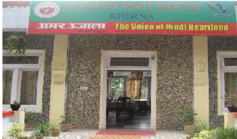
Picture: 7.2.3 Glow Sign Board

Nigam stated (August 2007) that the Glow Sign Board were prepared by the newspaper agency and were installed at their cost. It has further been stated that the name of the TRH has been written on the Board and the monogram of the Nigam is also shown on the Board. The reply is not tenable as sign boards placed at the TRH itself would serve no purpose and the design of the board is hardly effective publicity.