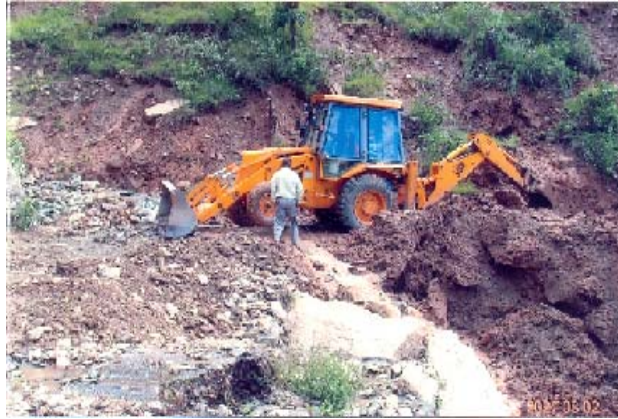
Picture: 4.1 Damaged road at km. 6.8

On this being pointed out, the EE replied (July 2007) that the road did not show any prior tendency of caving in and that the damage was due to cloud bursting and heavy rains, an unforeseen natural calamity. It was also stated that the depressions on the road have been removed by earth filling and it is open for traffic. The reply is not