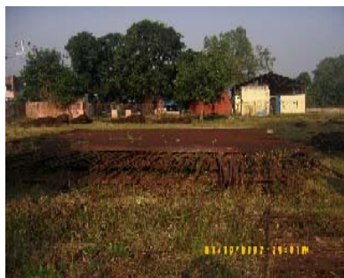
Picture:4.2 Steel at Dakpathar store

The Provisions of Financial Hand Book (Vol.VI) require that when any serviceable store is declared as surplus to the requirements, it should at once be reported to the Store Purchase Officer of the State for notification in the store