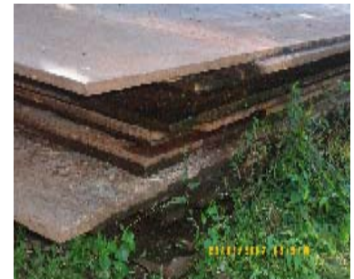
Picture: 4.3 Steel at Harrawala store

purchases supplement to the State Gazette. If the notification does not result in its use by resale or inter-departmental transfer within six months from