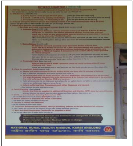
Citizen charter at Manja PHC

One of the objectives of RKS is to develop a Citizen Charter for every level of health facility and ensure that it is appropriately displayed to make healthcare applicants aware of their health rights and facilities available there. The Charter is also to give a specific and definitive commitment in writing to the citizens for delivering standardised services within a specified time frame. Compliance to Citizen's Charter was to be ensured through operationalization of a Grievance Redressal Mechanism. Scrutiny revealed that while the Citizen Charter was displayed in all 5 HMCs, it was displayed only in a few CHCs and PHCs test checked in the five sampled districts as can be seen from the following chart.