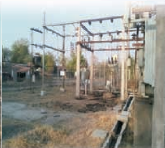
Substation at Dewas