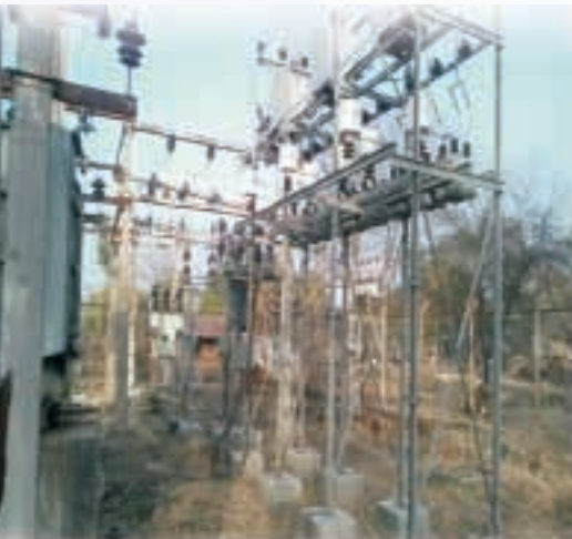
Substation at Dhar