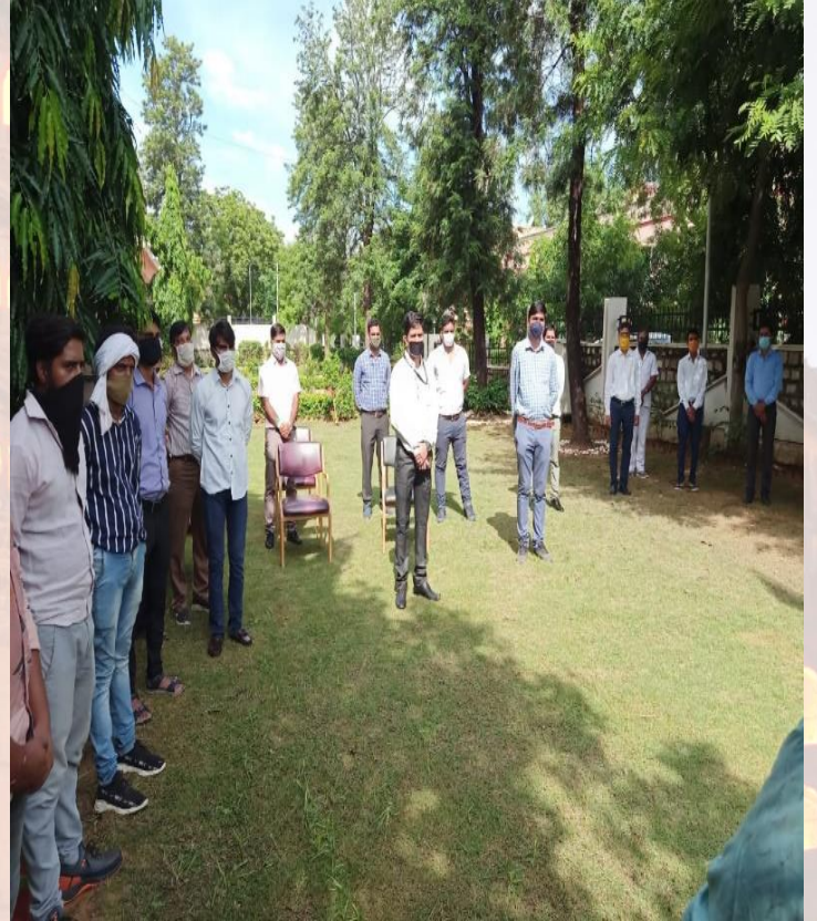
Independence Day Celebration in the Regional Training Institute