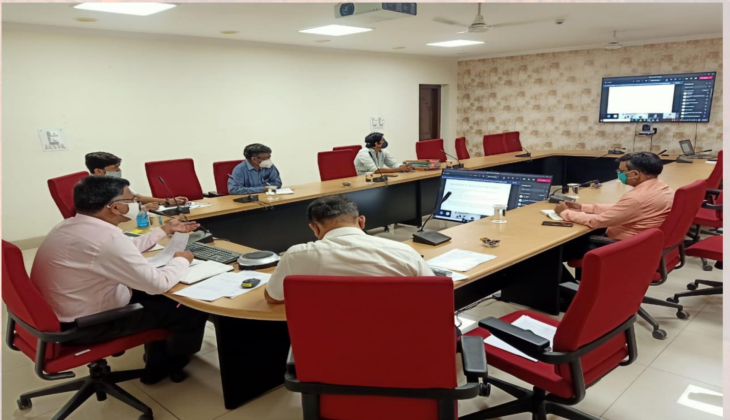
Regional Advisory Committee meeting 01 October 2020