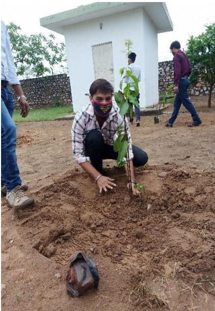
Tree Plantation at the Premises of Regional Training Institute

Regional Training Institute, Jaipur is situated in the verdant AG colony campus at Bajaj Nagar. To add to the greenery, a small orchard of 35 trees was planted on 16 July 2020 with the support of CPWD (Horticulture Branch). All employees/officers of RTI and Dy./Asst. Director (Horticulture) participated and planted trees.