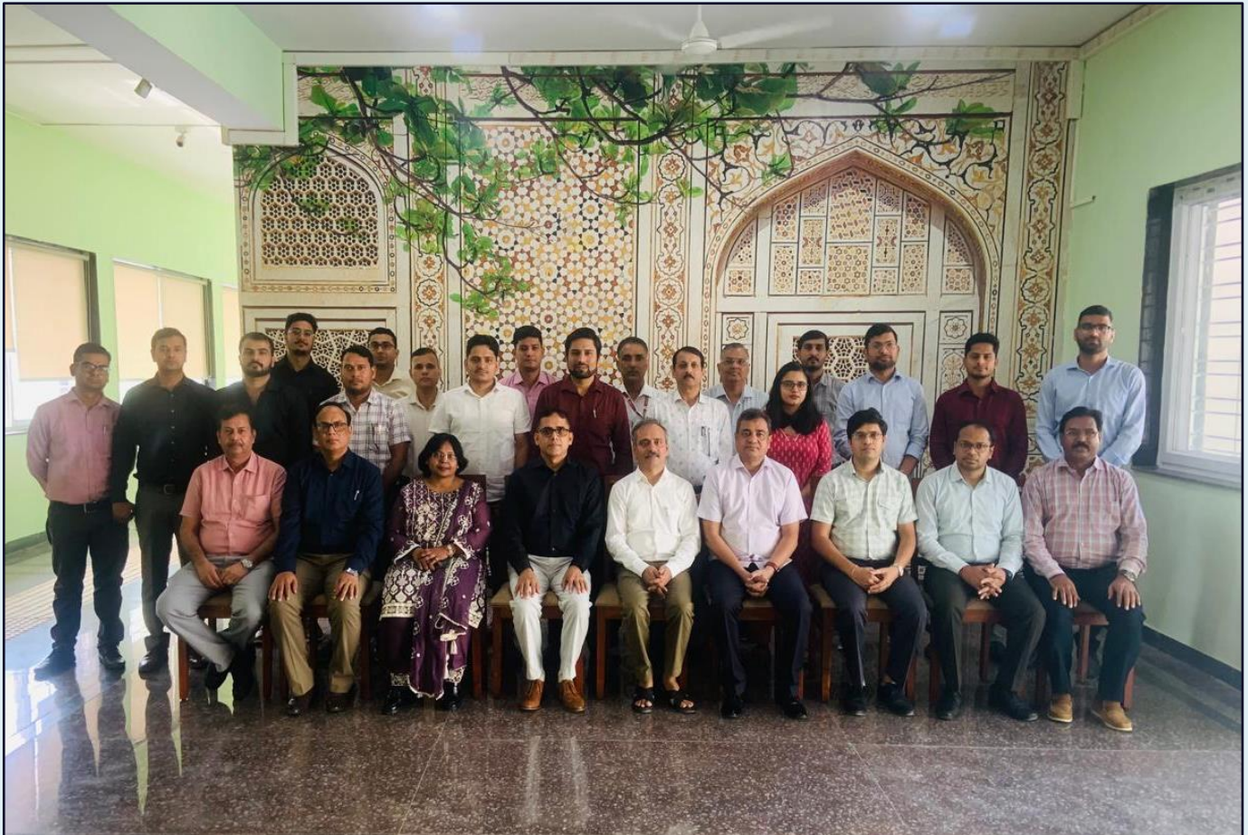
All India Seminar on “Performance Audit” from 30.09.2024 to 01.10.2024