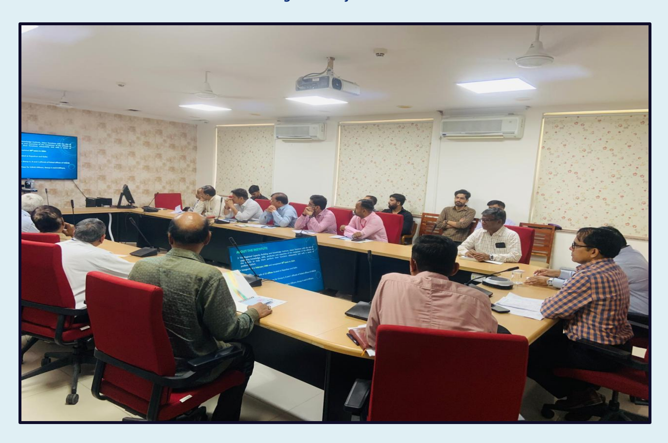
Session by Pr. Accountant General (Audit-1), West Bengal