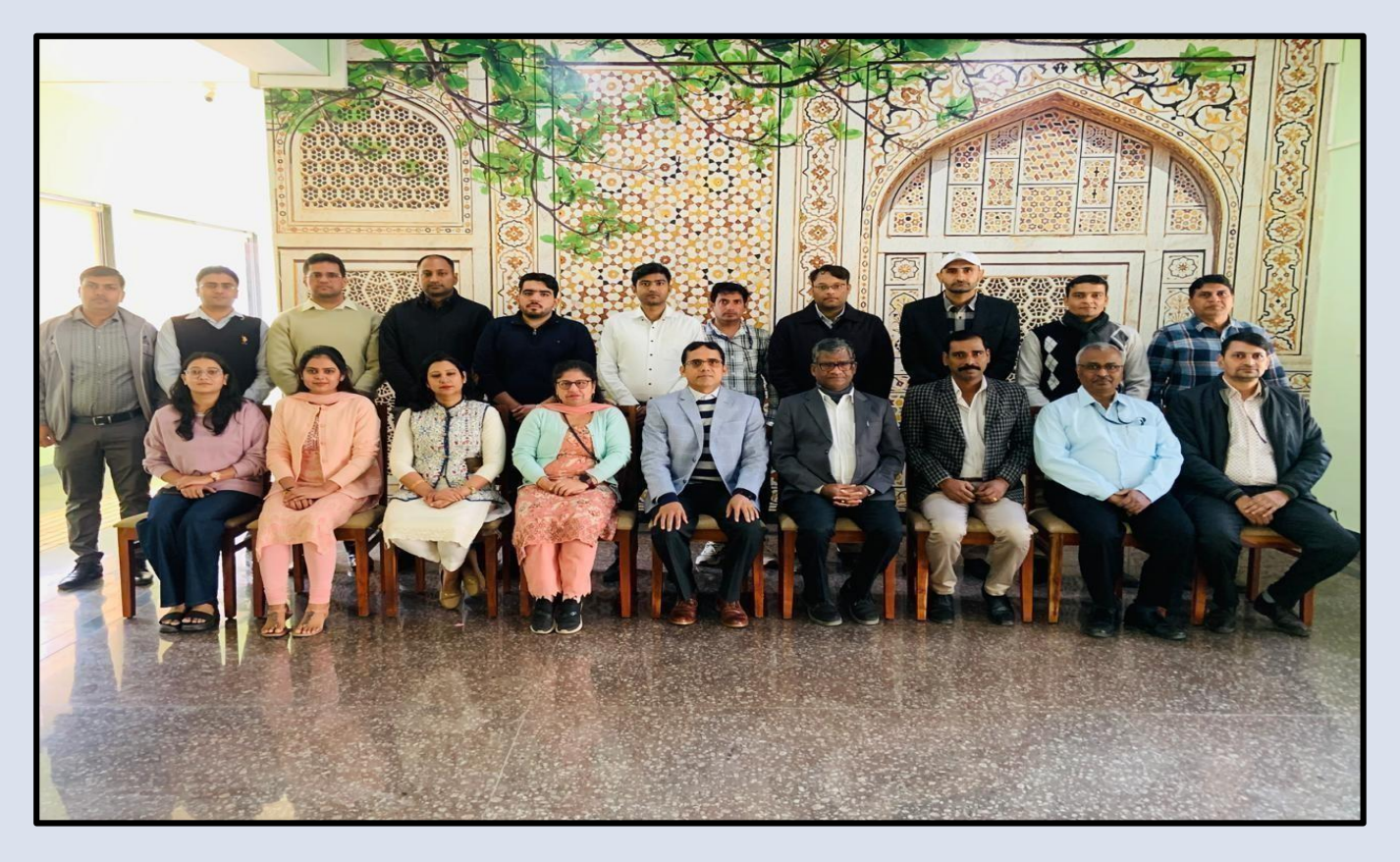
Compliance & Financial audit autonomous Bodies from 16.12.24 to 20.12.24