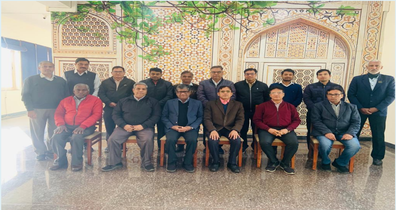
Glimpses of field visit of participants of MCTP Level 3