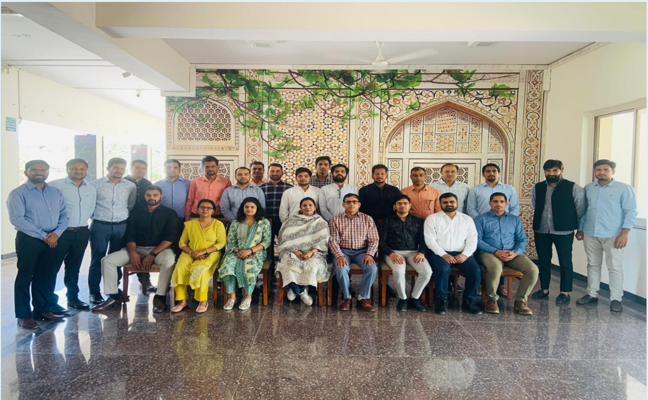
Six-Week orientation Training from 05.02.2024 to 15.03.2024

Institute has planned another Six-week orientation training for DPAAOs and supervisor between 4 th April 2024 and 17 th May 2024.