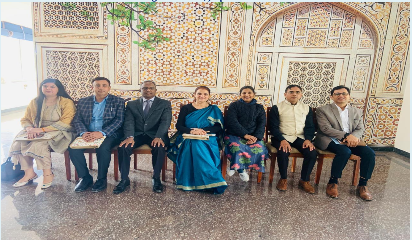
RAC meeting at RCB&KI, Jaipur on 02.02.2024

PD, RCB&KI stated that 83 sessions were taken by IA&AS officers in the training courses during this period, he thanked all the HODs of User offices for providing faculty support. PD, RCBKI also informed the RAC that 05 case studies for the use of training purpose have been prepared this year by RCBKI and sent to HQ for approval. The calendar of training programs (CoTP) for 2024-25 was discussed in details with the RAC members and members of the RAC accorded approval to it. The CoTP 2024-25 has now been finally approved on SAI by the headquarter.