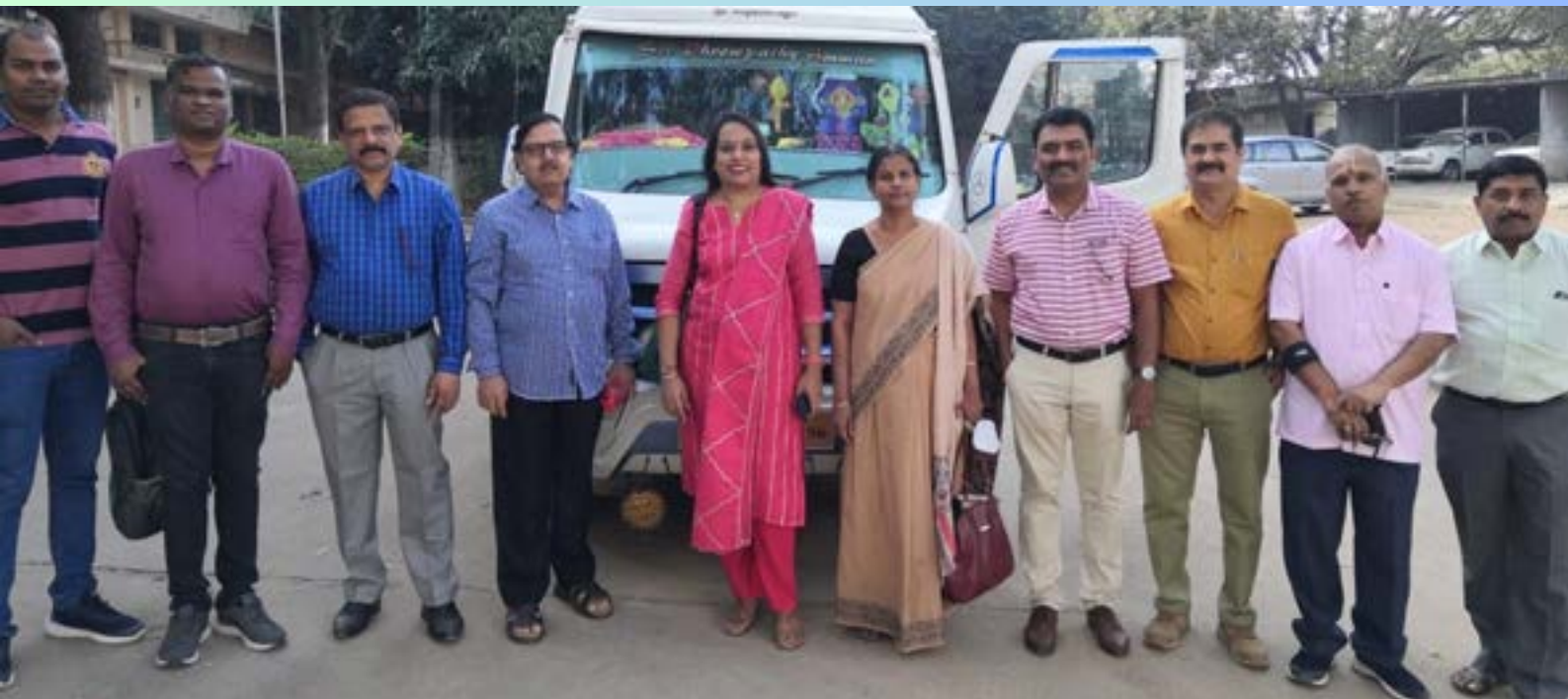
Participants of MCTP 3 on field visit to NIANP, Bengaluru

The trainees were provided an insight on the NIANP's functioning in the various laboratories and research findings/ongoing research projects in various units- Fodder Production Unit, Experimental Livestock Unit, Centre for Climate Resilient Animal Adaptation Studies and Centre for Laboratory Animal Research which was highly educational. The Live demonstration of Drum Silage process undertaken for fodder conservation to feed animals during lean/scarcity periods was fascinating experience to watch and learn about methods adopted for fodder conservation.