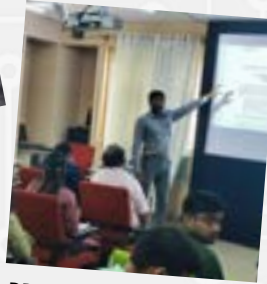
DRAAO-CGLE 2019 Batch-SAS Prep training