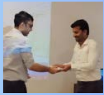
Winner of Kahoot Quiz