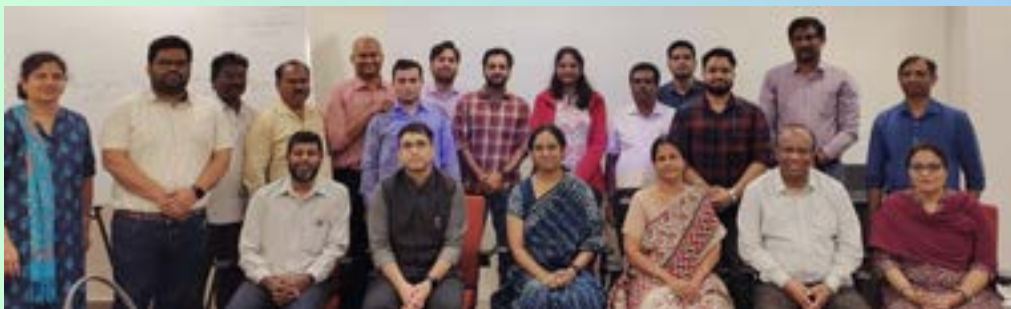
Audit of Fraud and Forensic training participants with PD and DD/RTC and RTC Faculties

One Group A Officer and various Sr. Audit Officers from the field offices handled the sessions during the training. All the topics were rated the best during the training.