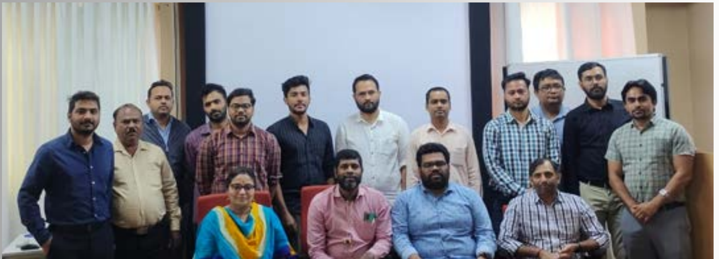
Data Analytics with 'MS Access'- Participants with RTC Bengaluru IS faculty

There were 13 participants from user offices and the course was rated well.