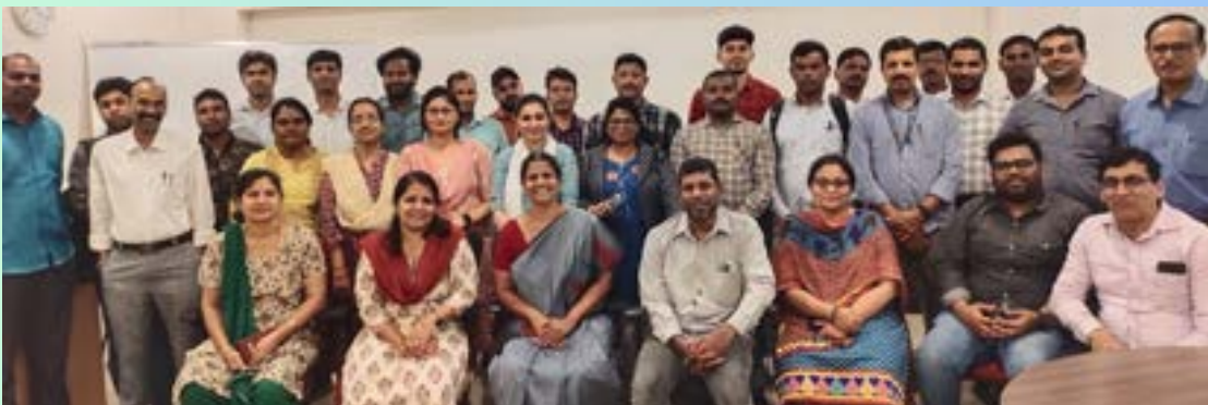
Participants of PFMS & iBEMS