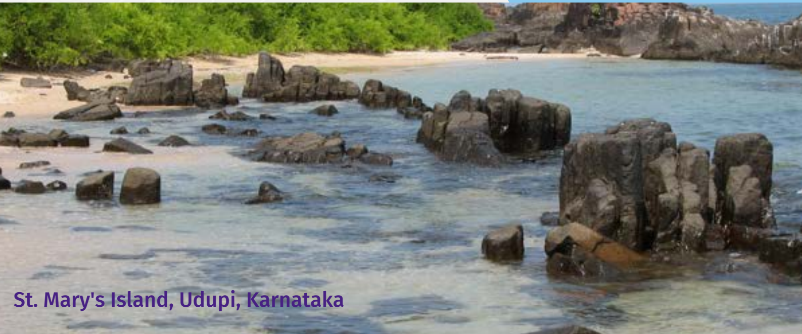
St. Mary's Island, Udupi, Karnataka