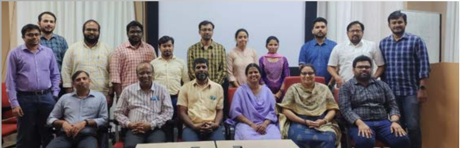
Data Analytics with 'R' - Participants with RTC Bengaluru faculty

The course was well received, and the participants have given very good feedback for these sessions.