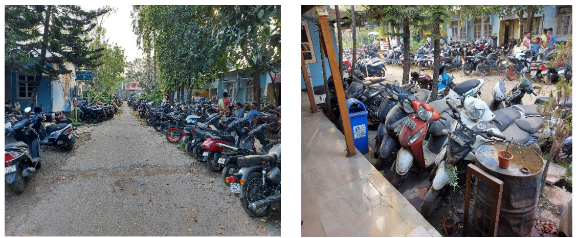
Image showing seized/ stolen vehicles kept inside the premises of Dispur P.S.

On field visit to Dispur PS, it was observed that many seized/stolen vehicles were kept inside the premises of PS with Malkhana Register Number (MR No.) registered against them, but no corresponding entry was made in the Malkhana Module under CCTNS. Maintenance of centralised database of vehicles using the Module can help in locating the rightful owners of vehicles which is not possible in the current system.