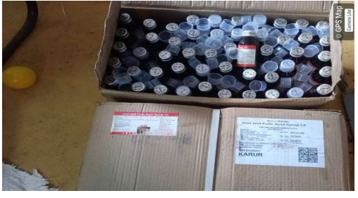
Exhibit 2.16: Expired Iron/Folic Acid syrup and ORS powder at CDPO, K.Paramathi