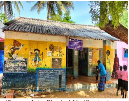
Exhibit 2.14(i): AWC functioning under asbestos roofing - Kanjirangudi Pallivasal Street in Tirupullani Block, Ramanathapuram District

Further, facilities viz. , compound wall (49), playing area (55), fire extinguisher (46), wicket gate (63) and ramp facility (38) were also not available ( Exhibit 2.14(ii) ).