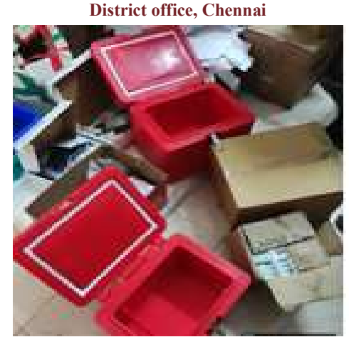
Exhibit 2.3: Portable Chill boxes kept at