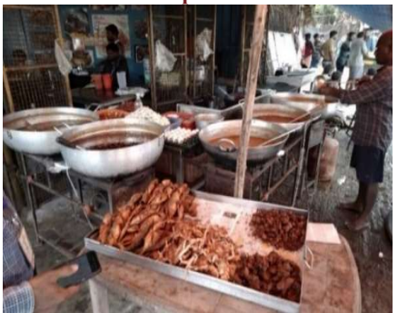
Exhibit 2.9: Chennai - Coloured cooked food items kept uncovered