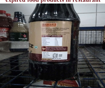
Exhibit 2.10: Coimbatore – Use of expired food products in restaurant