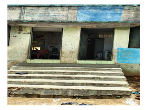
Exhibit 2.14(ii): AWC without ramp facility - Thotti Colony, Theni Urban Block, Theni District

The AWCs functioning in rented buildings do not benefit from the funds provided for upgrading AWCs and are also not eligible for the annual maintenance grant. The delay in construction of AWC buildings as discussed in Paragraph 2.2.10.5 resulted in depriving such AWCs of the various benefits of ICDS and hampered the effective delivery of services under the scheme.