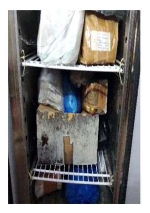
Exhibit 2.7: Samples dumped in the room without proper segregated arrangement at District office, Coimbatore