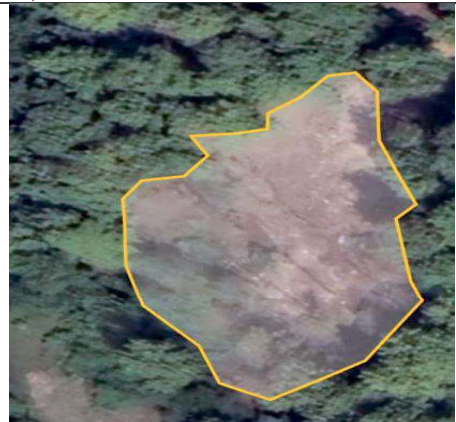
Nagar Nigam Korba (Balco), Lat 22.4030590 Lon 82.7534350