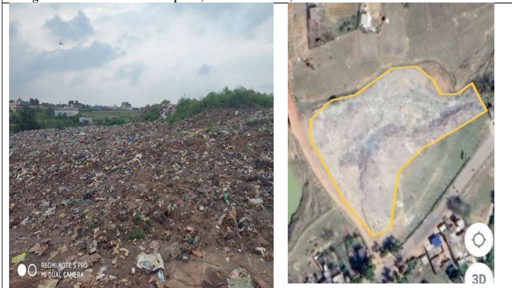
Nagar Palika Parisad Jashpur, Lat 22.89500, Lon 84.15607