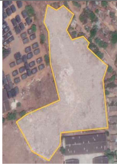
Nagar Palika Parisad Jangir-Naila, Lat 21.988065, Lon 82.580233