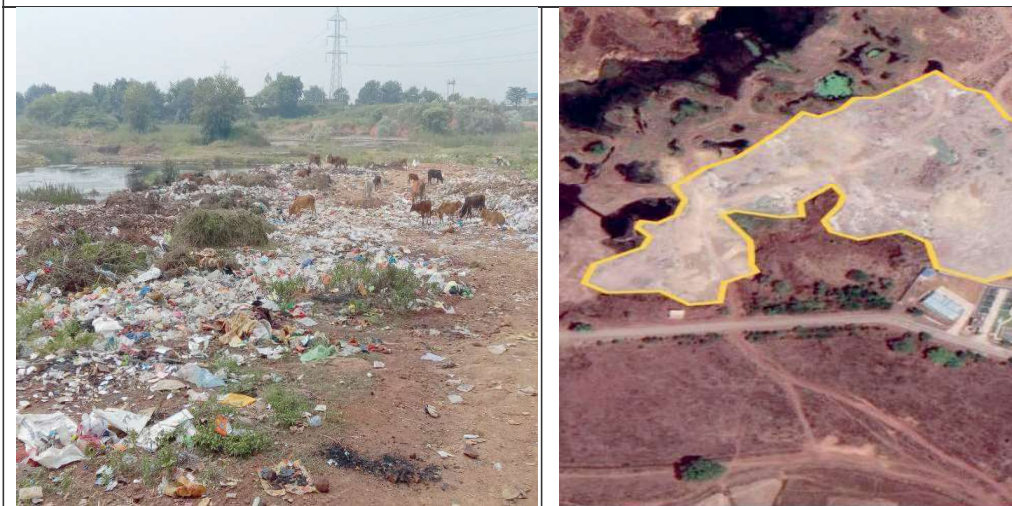
Nagar Palika Parisad Kumhari, Lat 21.269403, Lon 81.530512