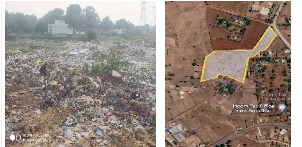
Nagar Palika Parisad Bhatapara, Lat 21.734865, Lon 81.972123