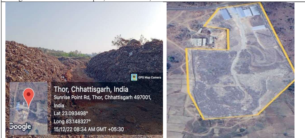
Nagar Nigam Ambikapur, Lat 23.093647, Lon 83.147312