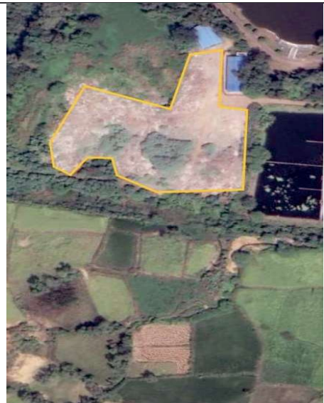
Nagar Nigam Korba (NTPC), Lat 22.410015, Lon 82.650509