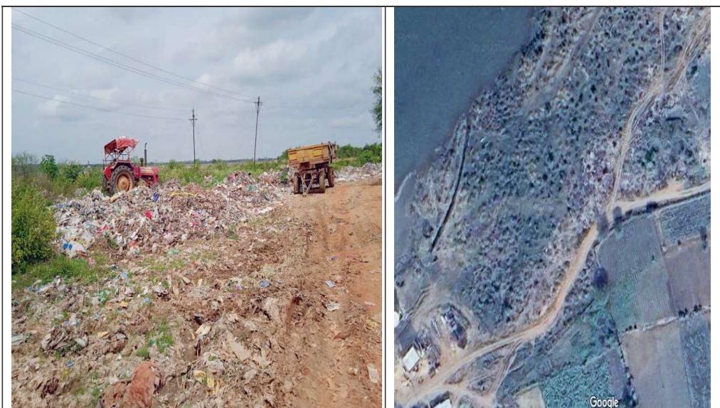
Nagar Panchayat Rajim, Lat 20.97980, Lon 81.88659