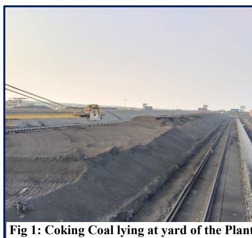
Fig 1: Coking Coal lying at yard of the Plant

The Plant proposed (June 2017) to procure two lakh tonnes of coking coal to meet three months' production as the Coke Oven Battery was planned for light up 2 in September 2017. A Global Tender Enquiry was floated in January 2018 which had to be cancelled as bidders were not meeting certain technical as well as commercial requirements. Subsequently, another Global Tender Enquiry was issued in June 2018 and order was placed in August 2018 for supply of two lakh tonnes of coking coal with landed price of ₹23,004/- per tonne. As per delivery