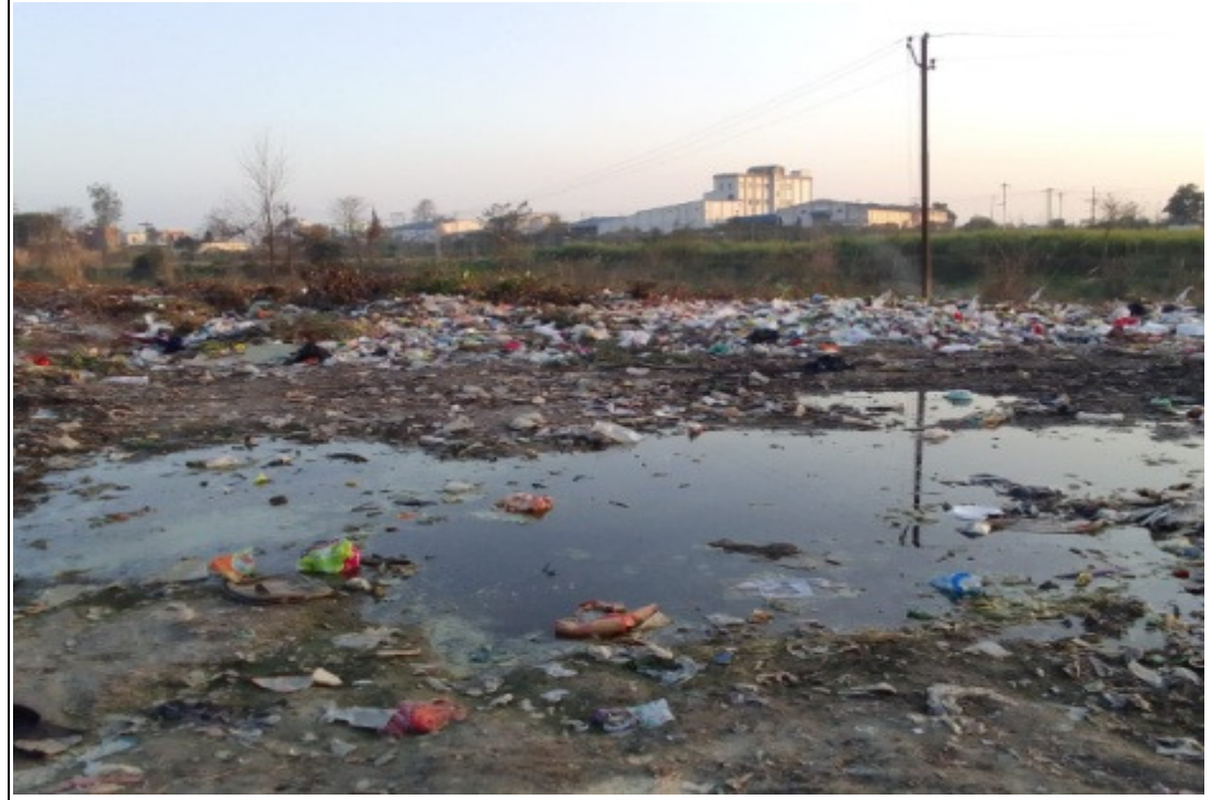
Photo-4.4: Photograph taken at the time of Joint Physical verification of Dumping site (31 January 2023), NP Dineshpur

The Member Secretary, Uttarakhand Pollution Control Board (UKPCB) stated (December 2023) that due to manpower shortage lesser reviews were conducted. The draft service rules for appointment to various cadres/vacant posts in UKPCB has been sent to State Government for approval. Action regarding pending penalty proposal is under consideration and action will be initiated after replies of the ULBs are received.