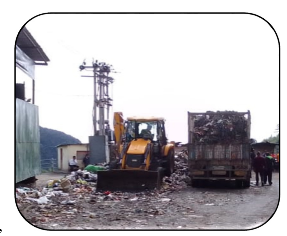
Photo-4.5: Waste transported through Trucks in NPP Mussoorie (10 October 2022)

hazardous and other wastes (Management and Transboundary Movement) Rules, 2016 provides that in case of transportation of hazardous and other waste for final disposal to a facility existing in a State other than the State where the waste is generated, the sender shall obtain 'No objection certificate' from the State Pollution Control Board of both the States. Further, to regulate inter state movement of waste the Municipal Commissioner, Executive Officer, Member Secretary and Regional Officers Pollution Control Board were responsible.