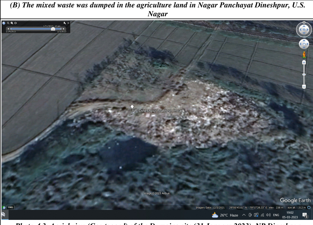
Photo-4.3: Aerial view (Geo tagged) of the Dumping site (31 January 2023), NP Dineshpur