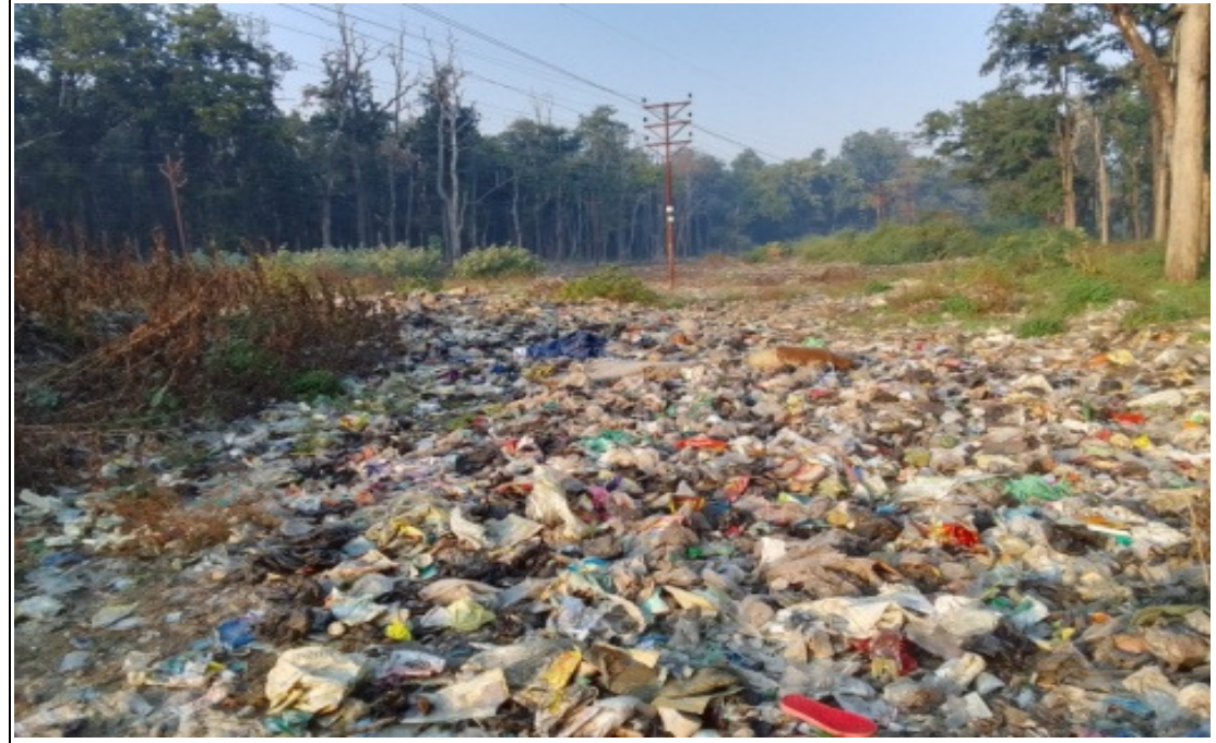
Photo-4.2: Photograph taken at the time of Joint Physical verification of Dumping site (14 January 2023), NPP Khatima