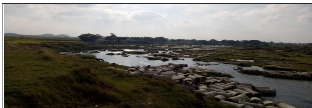
Picture 3.1: Incomplete main trunk line near Lem-Bergain bridge- Jumar river (20 October 2021)

Audit also conducted (20 October 2021) a joint physical verification of the work sites, with the officials of RMC, and noticed that the main trunk line had not been laid in a stretch of eight km. The pipes were found lying idle at the work site ( Picture 3.1 ). Thus, about 115 km (60 per cent of the total network of 192 km) of the sewerage network would not be linked with the STP.