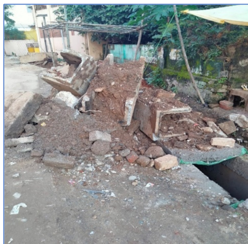
Picture 3.2 Dismantled storm water drain at Harihar Singh Road (20 October 2021)

being done by RMC, at the same site. On enquiry by Audit, the contractor of the said new drain work stated that the earlier constructed pre-casted drain (length 360 metres) was of no use in the new work.