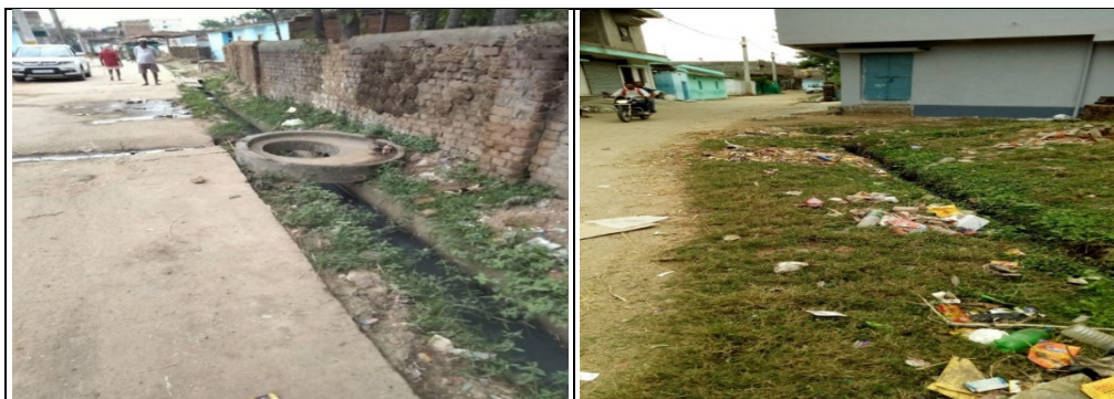
Picture 3.3 and 3.4: Storm water drain structure in Booty Basti and scattered solid wastes along the sides of the drain (22 November 2021)

➤ At Booty Basti, no pre-screening arrangement for solid wastes was found in the storm water drain and water logging was noticed at the drain ends. Moreover, this drain was not connected to any drain network and waste water from septic tanks was flowing into the open storm water drains, making them polluted. Thus, the drain was not only a waste of public resources but also a health hazard.