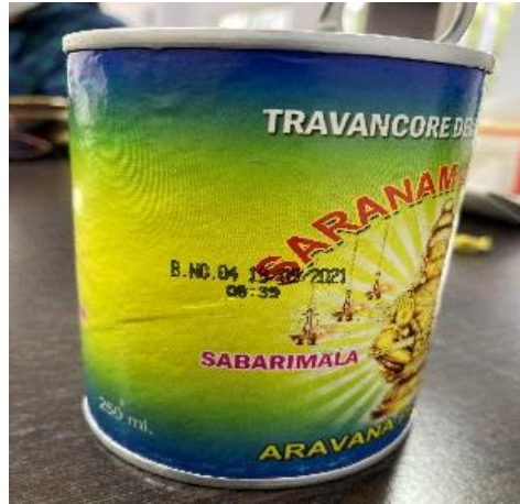
Figure 2.1: Aravana Prasadam container without full labelling details, Photograph taken by Audit party on 20.09.2021

Audit analysed the label on the Aravana Prasadam container and noticed that the label on the sealed container contains only name, batch number, name and address of the manufacturer and date of packing. All other details especially “use by date” as required under the Regulation are not being included in the label. The absence of food label with necessary details deprives the end user, information regarding its ingredients and date before which it can be used.