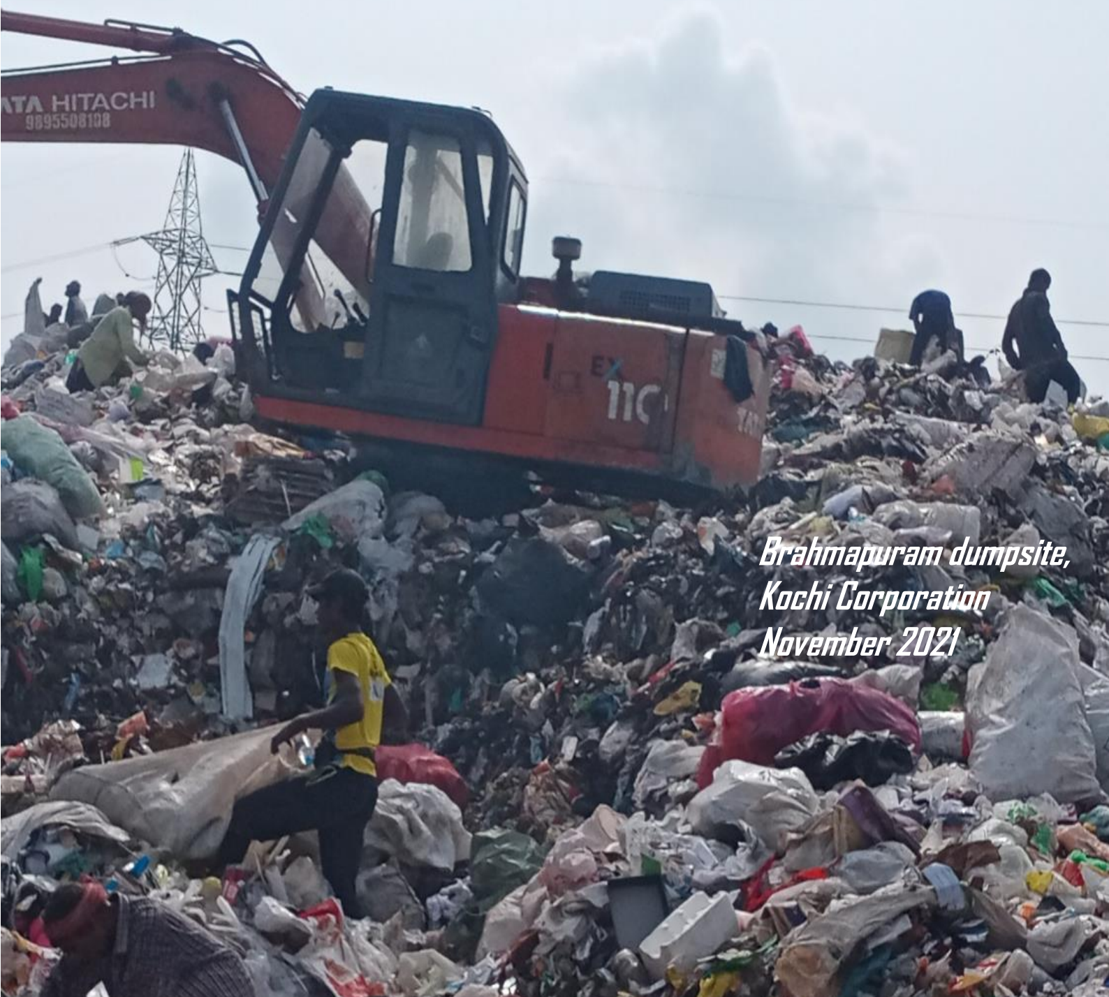
Brahmapuram dumpsite, Kochi Corporation November 2021