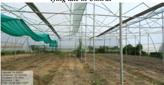
Polyhouse at Sendra (Bishnupur District) lying idle