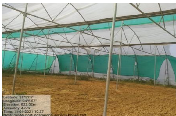
Polyhouse No-1 for Ukhrul lying idle/uncultivated