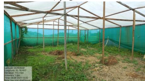
Low cost polyhouse at Sendra (Bishnupur District) lying idle.