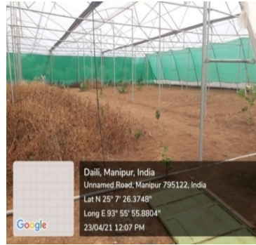
Polyhouse No-1 at Haipi lying idle/uncultivated