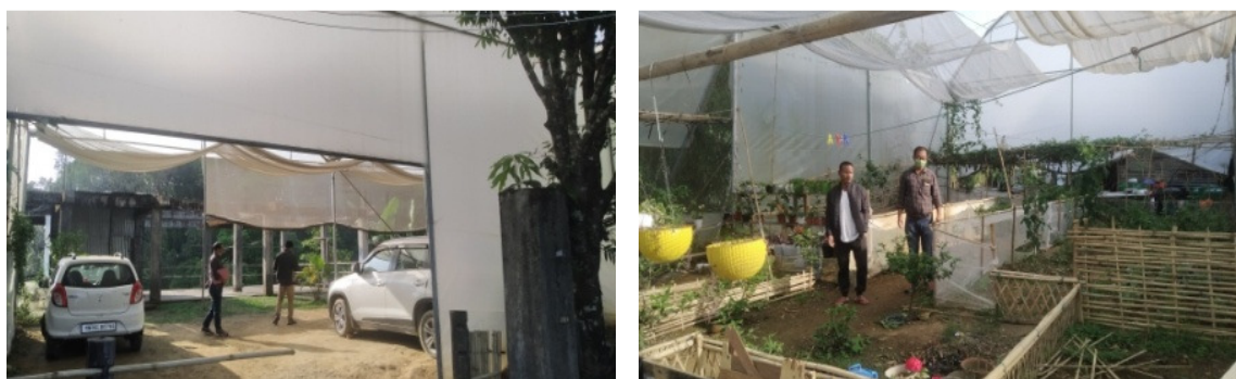
Floriculture Centre of David Panmei at Utopia-One part was utilised as garage and other as kitchen garden. No plantation of Gypsophylla

The following photographs show the five floriculture centres lying idle: