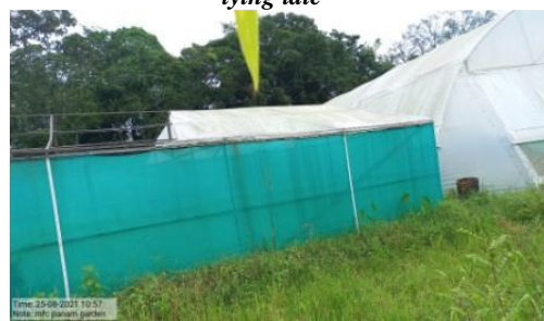
Badly damaged Low cost polyhouse at Panam Garden (Imphal East District) lying idle