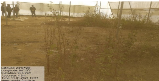
Mist chamber at Litan Centre (Ukhrul District) lying idle in Ukhrul