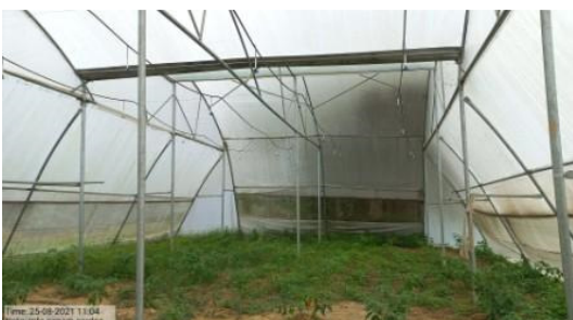
Mist chamber at Panam Garden (Imphal East District) lying idle