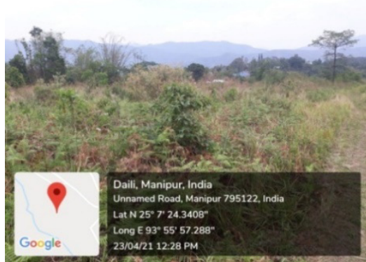
No drip irrigation structures installed at Haipi centre (Kangpokpi District)