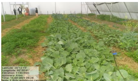
Floriculture Centre of E Robi at Mayangkhang with vegetable plantation instead of carnation plantation