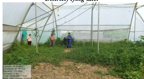
Mist chamber at Sendra (Bishnupur District) lying idle