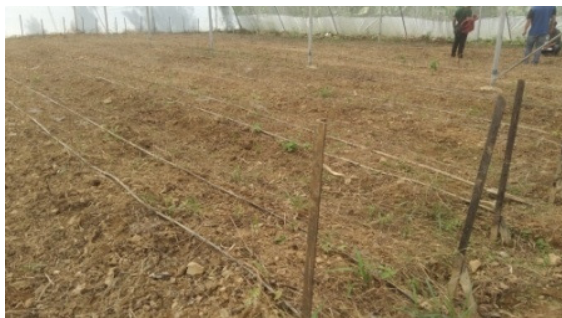
Floriculture Centre of Gaikhangdam Thamei at Rangkung lying idle