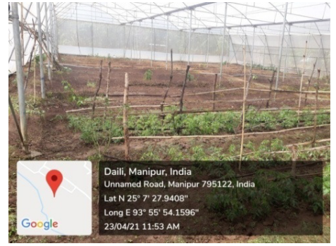
Polyhouse No-2 at Haipi lying idle/uncultivated

It can be seen from above, the Model Horticulture Centres at three locations (Ngarumphung, Tupul and Haipi) were yet to be completed (April 2021) now for over two years. As most of the structures, inputs and machineries were not installed or found at the sites, it is clear that project was not implemented properly on the ground. Moreover, the completed structures remained idle/unutilised.