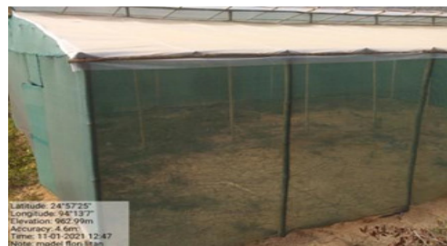
Low Cost Polyhouse at Litan Centre (Ukhrul District) lying idle/unutilised