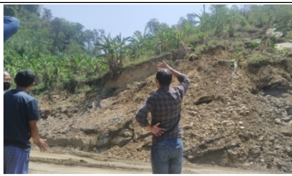
Orchard of Khiuluwang Kamei at Chaengdai found destroyed due to road expansion