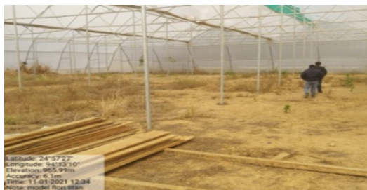
Polyhouse at Litan Centre (Ukhrul District) lying idle/unutilised

(ii) Joint inspection (March and August 2021) revealed that three Polyhouses, six low-cost Polyhouses and three Mist Chambers installed in June 2019 at the cost of ₹ 85.37 lakh were lying idle/unutilised. These can be seen from the following photographs: