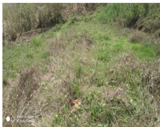
No drip irrigation structures installed at Tupul Centre (Tamenglong District)