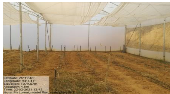
Floriculture Centre of P.H Kiihne Dumai at Senapati lying idle