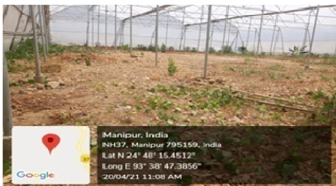
Polyhouse No. 2 for Tamenglong Centre lying idle/uncultivated

(iv) It was also noticed that eight naturally ventilated Polyhouses (Ukhrul-3, Kangpokpi-3 and Tamenglong-2) installed at a cost of ₹ 1.32 crore were lying unutilised/idle. The details are shown in Appendix 5.3 Some photographic evidence of Polyhouses lying unutilised/idle are as shown below: