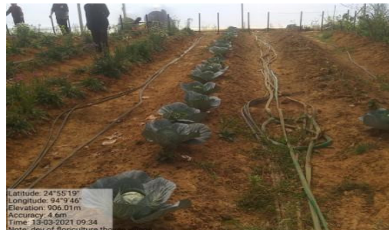
Floriculture centre of V S Rinchui of Thoyee Village with vegetable plantation instead of carnation plantation

Thus, an expenditure of ₹ 62.06 lakh 54 incurred towards establishment of five centres for a total area of 2,500 Sqm did not achieve the objective of establishing model Floriculture Centres even after a lapse of 17 months from the date of installation.