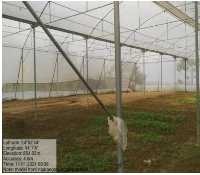
Polyhouse for Ukhrul Centre lying idle/uncultivated