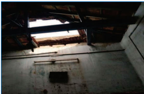
Picture 1: Vasavi Vignana Mandali degree college, Visakhapatnam in dilapidated condition.