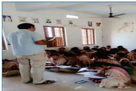
Picture 2: Government Women degree college, Marripalem, Visakhapatnam District without furniture