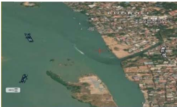
Fig. 29: Flow of untreated sewage from wet wells of the western area of Mangalore City to the Arabian sea

Out of the 12 Urban Local Bodies 45 located along the coast of Karnataka, only Mangalore City