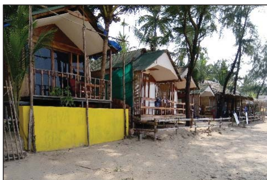
Fig. 23: Wooden huts at Agonda Beach

management plans for these sites were not prepared. Further, as per the provisions of the notification, no development activities were permitted in these turtle nesting sites. However, we observed shacks being allowed at the nesting sites of Agonda , Morjim and Mandrem beaches, as shown in the pictures below-