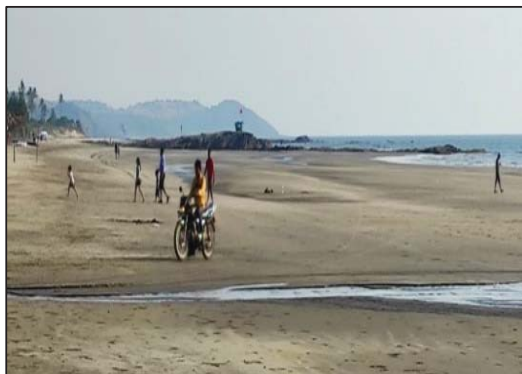
Fig. 26: Motor vehicles plying on beaches

C. The Sand Dune report also revealed sand dune erosion along the coastal stretches of