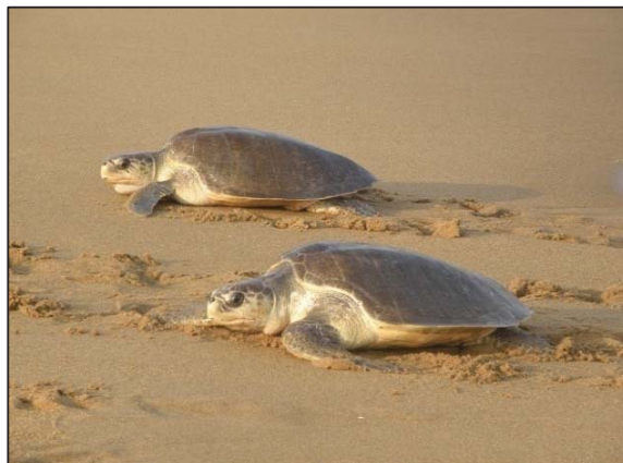
Fig. 22: Olive Ridley Turtles 39

Olive Ridley turtles are legally protected under Schedule I of the Wildlife Protection Act, 1972, which prohibits trade in the turtle products. Olive Ridley is the only species of sea turtle known to nest at the beaches of Goa. There are four designated nesting sites 38 as per the CRZ Notification. As per CRZ notification 2011, management plans for turtle nesting sites was required to be prepared. Audit observed that