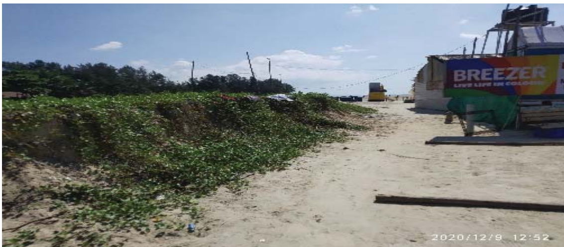
Fig. 25: Destruction of sand dunes for new beach shacks

During a JPV, it was observed that the sand dune was cut and flattened to make space for new beach shacks as shown below: