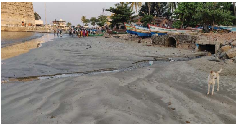
Fig. 30: Urban sewage directly entering coastal waters at Murudeshwar Beach

show the flow of untreated sewage from the wet wells of western area of Mangalore City to the Arabian sea. We also observed that untreated waste from the coastal towns of Karwar, Murudeshwar was being let into the sea.