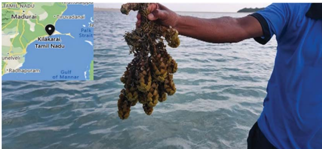
Fig. 21: Dead coral covered with algae

Audit observed that out of the 100 sq. km coral area in Gulf of Mannar Marine National Park, the department removed these seaweeds only to an extent of two sq. km (2% of the total reef area) during 2015-16 to 2019-20 as targeted in the management action plans for the Conservation and Management of Corals Scheme of MoEF&CC. Also, despite the serious reduction and degradation of the live coral cover, no viable strategy to mitigate the propagation of the invasive species had been devised or implemented by the Department of Forest, Tamil Nadu.