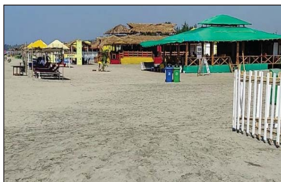
Fig. 24: Beach beds in intertidal zone (turtle nesting sites) at Morjim Beach