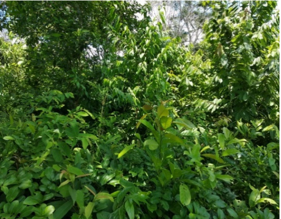
Photograph 3.2.5: Karamcherra Orchard