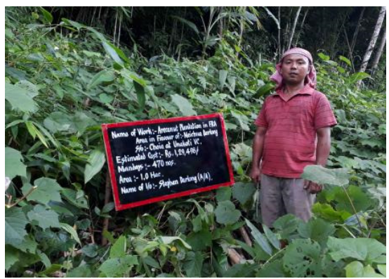
Photograph 3.2.3 Photograph 3.2.4 Photographs 3.2.3 and 3.2.4 shows arecanut plantation in the Unakoti Village under Unakoti District. However, no arecanut plantation is visible in both the photographs.

The Government stated (January 2022) that in few cases, poor maintenance of created plantation under MGNREGS from 2<sup>nd</sup> year onwards by the farmers was the main constraint in horticulture plantation.