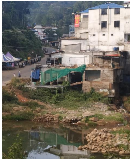
Figure 4.1: Reconstruction of hotel building washed away in flood of 2018. 20 December 2019, Cheruthoni riverbed, Idukki District, Photo taken by Audit party, attested by Tahsildar, Idukki Taluk

Consequent to a mass petition filed by residents of Idukki (March 2008) before Hon'ble Chief Minister regarding illegal constructions of multi-storied buildings in CFZ at Cheruthoni, a detailed enquiry by the LSGD and Power departments identified 62 buildings in the CFZ which would be inundated in the event of opening of dam shutters. Though GoK directed (November 2009) Secretary, Vazhathope Grama Panchayat to remove the buildings constructed in CFZ, no action was taken to comply with the direction resulting in many buildings and houses 96 being washed away and foundations of several buildings getting damaged consequent to the opening of shutters of Cheruthoni dam during the floods of August 2018. More importantly, the Tahsildar Idukki reported (April 2019) that new buildings were again coming up in the area where the buildings were washed away in 2018. The constructions were in violation of the orders (August 2016) of the District Collector in his capacity as Chairman of DDMA prohibiting construction in areas within the MFL of the Cheruthoni River. The Deputy Superintendent of Police, Idukki also reported (April 2019) that there was reconstruction of old buildings which were damaged in the floods of 2018, in violation of the order of District Collector. No action has also been