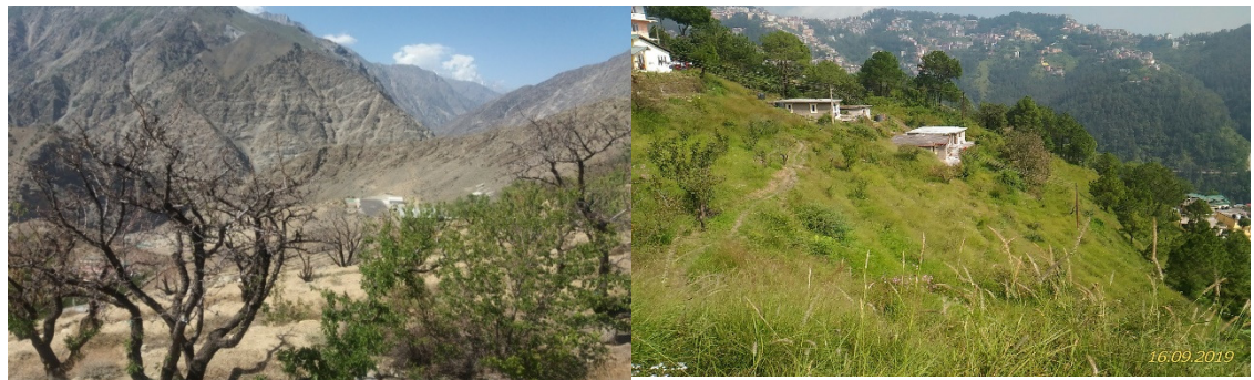
Dried and non-bearing plants in PCDO, Pooh Area without plantation at PCDO Rajhana (Shimla) (Kinnaur)

During physical verification (July-October 2019) of 12^{26} (out of 35) PCDOs/ nurseries ( Appendix 2.5 ) by audit along with departmental representatives in the test checked districts, it was noticed that against 64.50 hectare area of these PCDOs, 20.05 hectare (31 per cent ) was lying without plantation in 10 PCDOs.