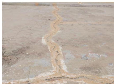
Leakage in roof in Museum building

The Government of Rajasthan (GoR) stated (October 2019) that there was no condition for providing University share in the sanction issued by ICAR. GoR also stated that the Museum had now been made operational.