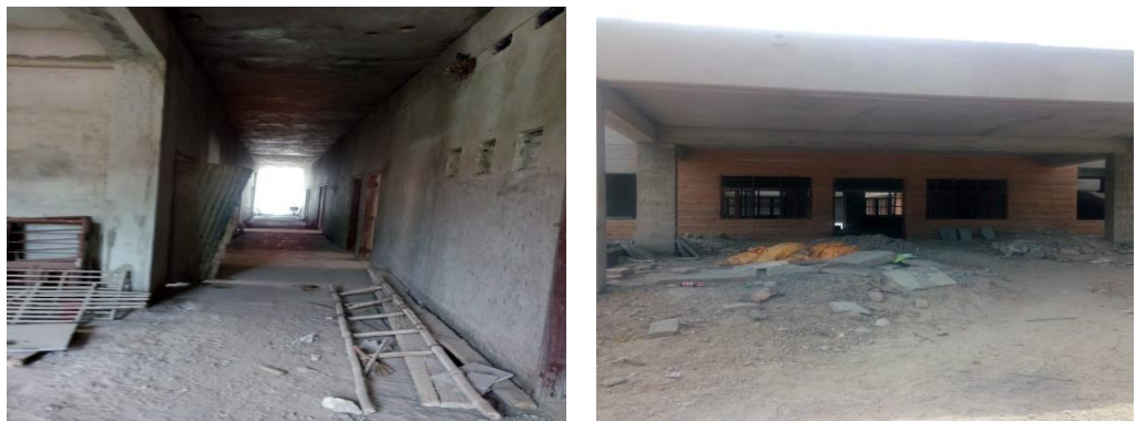
Pictures showing incomplete construction of Para Medical College at S.N. Medical College, Jodhpur (June 2019)

It was, however, observed in Audit that due to abnormal delay in finalisation of requirements and drawings of building, the project was delayed and against construction of building with a ground and three floors only skeleton of the ground floor (as shown in photographs below) was constructed even after lapse of seven years. The building was incomplete and work was at stand still since January 2018 for want of funds. This resulted in unfruitful expenditure of ₹ 3.89 crore incurred on the incomplete structure. Further, due to this delay, the cost of completion of remaining work also increased to ₹ 25.05 crore 15 . Moreover, GoR had also not released (till May 2019) its corresponding share of ₹ 59.29 lakhs (50 per cent of total state share) to GMC which was a precondition to release the second instalment by GoI. Due to non submission of UC for the corresponding state share, GMC also failed to obtain the 2 nd instalment of ₹ 3.36 crore from GoI.