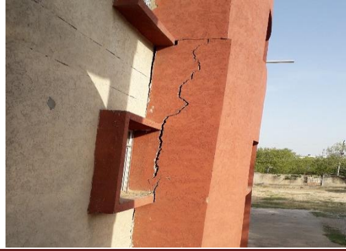
Cracks in walls of Research Hospital building