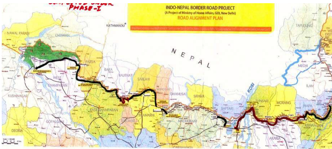
Map-1: Indo-Nepal Border Road Project

The main objectives of Indo-Nepal Border Road (INBR) project are to enable the SSB to dominate the sensitive border effectively; provide connectivity to BOPs by roads thereby adding to the mobility of the SSBs; and meet the requirements of the border population and catalyse better implementation of development initiative in border areas.