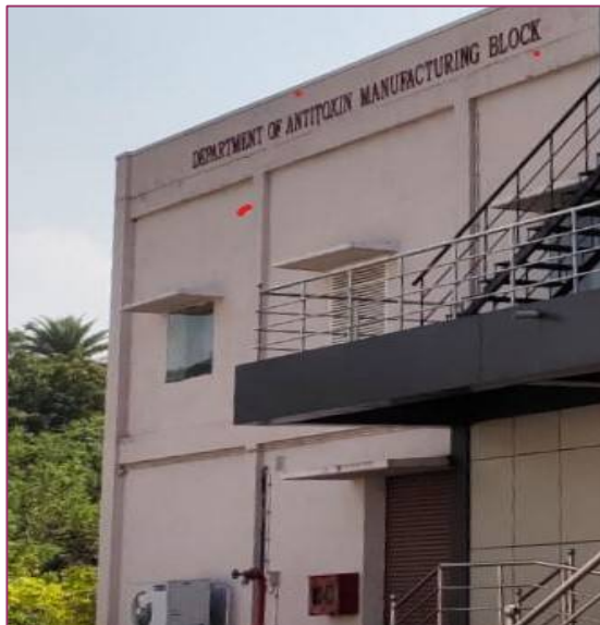
Exhibit 3.1: Newly constructed DAT building