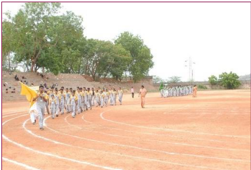
Exhibit 3.5: Land being unauthorisedly used as playground

The School did not pay the revised lease rent and also refused (2018) to apply for renewal of the lease on the pretext that their request for outright sale of the land was still under consideration by GoTN.