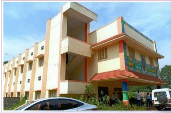
Exhibit 3.9: Full view of the Multipurpose hall