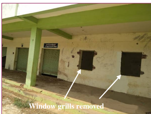
Exhibit 3.7: Damages caused to the asset