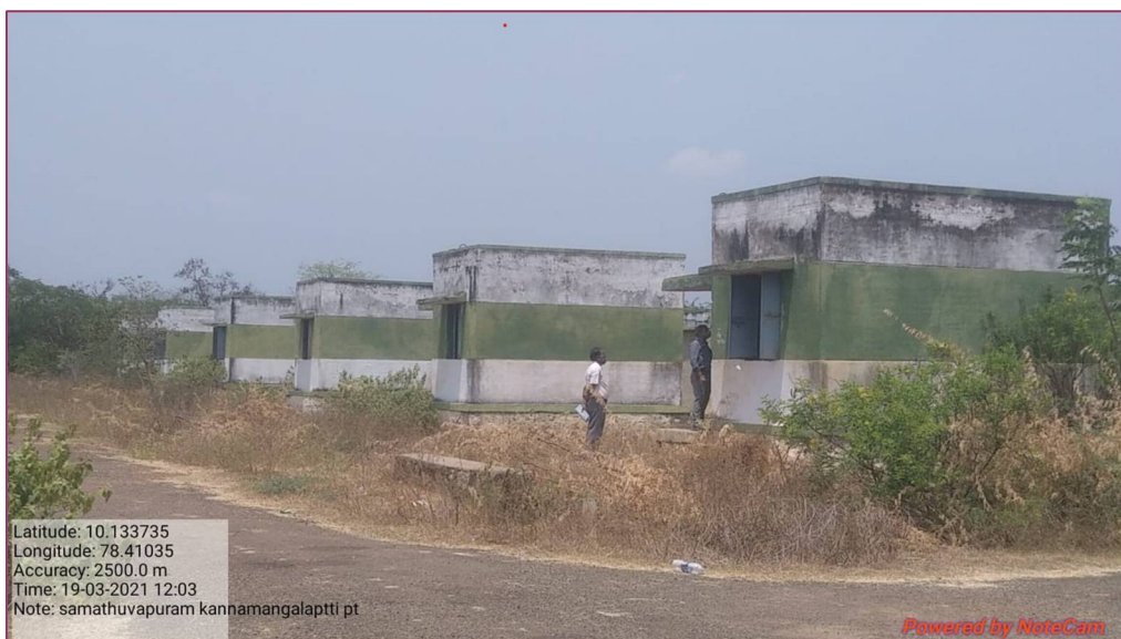
Exhibit 3.8: Street view of houses lying unoccupied

Thus, Audit observed that the beneficiary list was not finalised even six years after completion of construction.