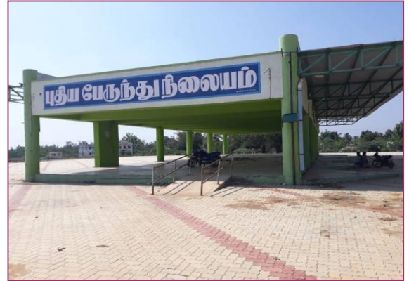
Exhibit 3.6: New bus stand at Gandarvakottai

Audit scrutiny (October 2018/ March 2019) of records of the Gandarvakottai PU for the period 2014-18 revealed that all the works were awarded (January 2014 to February 2016) through tenders for the sanctioned sum of ` 4.07 crore. Of this, the construction of bus stand was completed at a cost of ` 1.61 crore in November 2015 ( Exhibit 3.6 ), allied works (except black topping of the approach roads) were completed at ` 1.86 crore during August 2015 to September 2016 and the other works at ` 0.44 crore during May 2015 to January 2017.