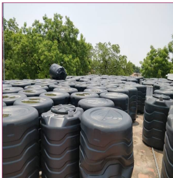
Exhibit 3.3: Tanks lying undistributed in the custody of Tharamangalam PU