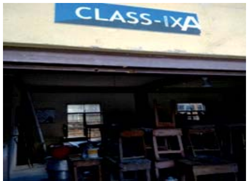
Strengthened Government Kulikawn High School was found unused