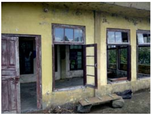
Library Room constructed at Government Ch. Chhunga High School remained unused