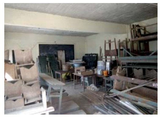
Art & Craft Room constructed at Government Bawngkawn High School remained unused

Photographs showing idle/ unutilised infrastructure created under RMSA of four State Government secondary schools amongst others, are shown below: