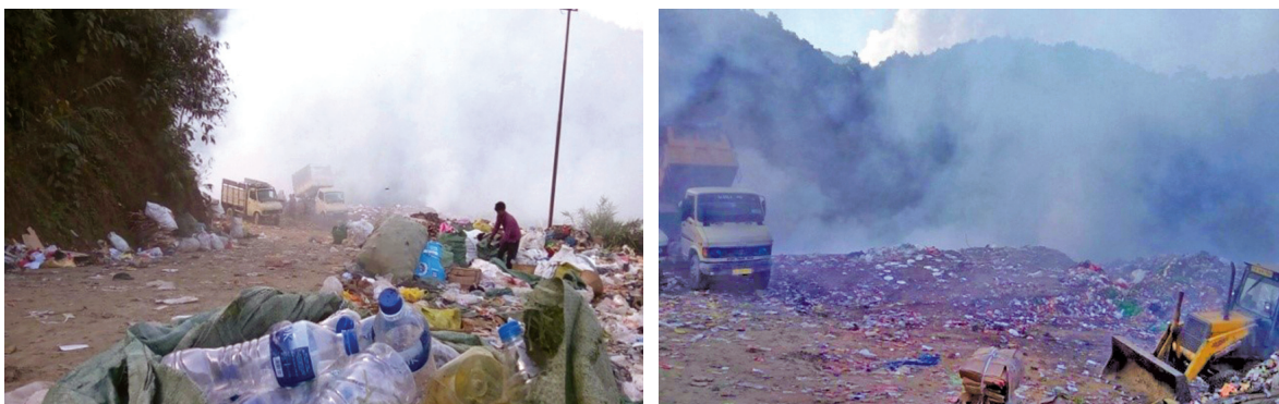
Photographs on burning of garbage at Tuirial dumping ground, Aizawl, Mizoram were taken on 21 November 2017 at 3:00 pm

In terms of Solid Waste Management Rules, 2016, wastes (dry leaves, garbage) should not be burnt. Audit, however, observed that heaps of garbage was burnt indiscriminately causing air pollution in and around the dumping site at Tuirial as shown in the photographs below: