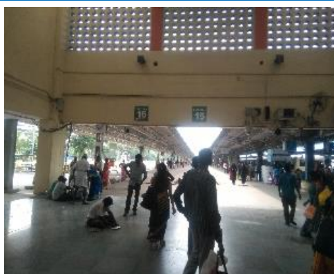
Fig.4.8 Two new platforms (No.15 and 16) at MASS