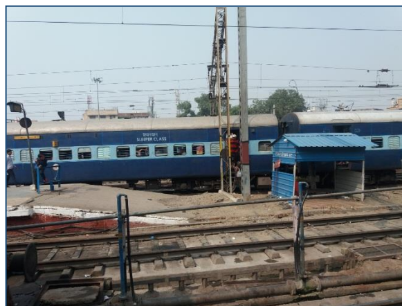
Fig.4.1 Train no. 12948 (Azimabad Express) having 23 coaches stopped at Platform no.3 (handling capacity of 15 coaches) at Kanpur Central Junction on 26.10.2017