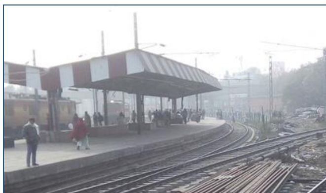
Fig.4.2 Platform 8 at Patna Junction