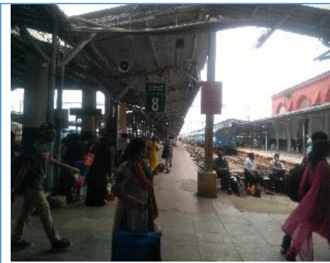
Fig.4.5 Platform No.7 and 8 at MAS