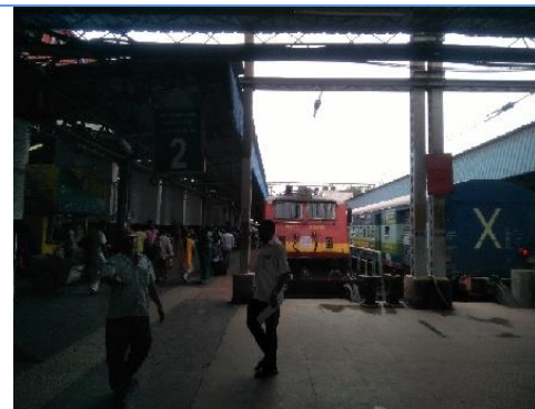
Fig.4.6 Platform No.1 and 2 at MAS