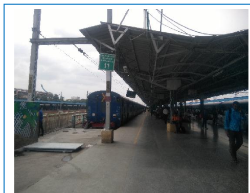
Fig.4.7 Platform No.11 at Chennai Central