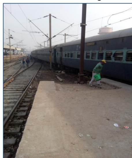
Fig.4.3 Platform no.6 (Mughalsarai Jn.), 5 coaches of Seemanchal Express (12487) standing outside the platform