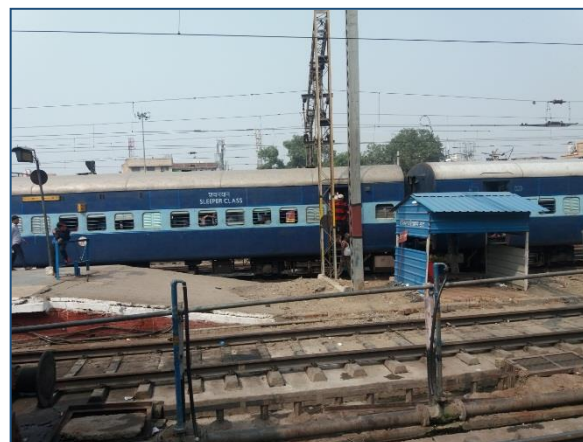
Fig.4.1 Train no. 12948 (Azimabad Express) having 23 coaches stopped at Platform no.3 (handling capacity of 15 coaches) at Kanpur Central Junction on 26.10.2017