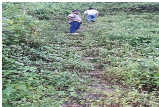
CC Steps at ₹ 9.00 lakh was constructed for village where there was no habitation.

Thus, the above schemes did not achieve the developmental needs and well being of the people as envisaged in the guidelines.