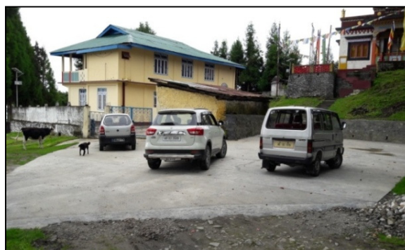
CC platform constructed instead of playground in the middle of an approach road to a private residence.

‘Playground at Changprong’ (₹ 9.00 lakh) executed by BDO, Tawang Block during 2016-17 was found to be a concrete platform on approach road to a private residence which was being used as parking space. The site-Engineer stated that due to non-availability of suitable land, the playground was constructed at the present site.