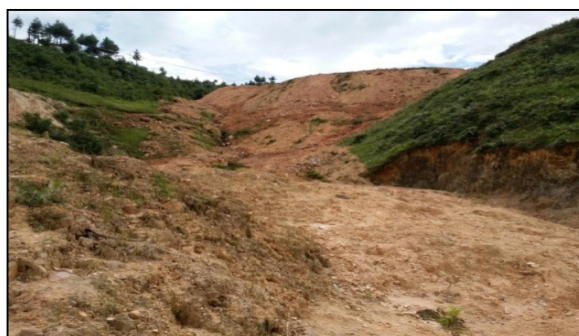
The site where the KGBV building was stated to have been constructed.