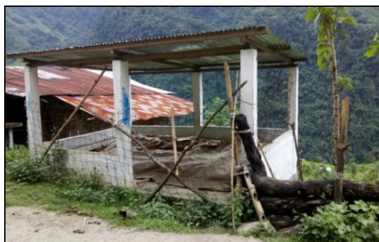
Bus Waiting Shed at Row Village enclosed with sausage wire being used as store room.