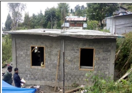
Physical progress of 'Staff quarters at PHC, Seru' found during joint inspection.