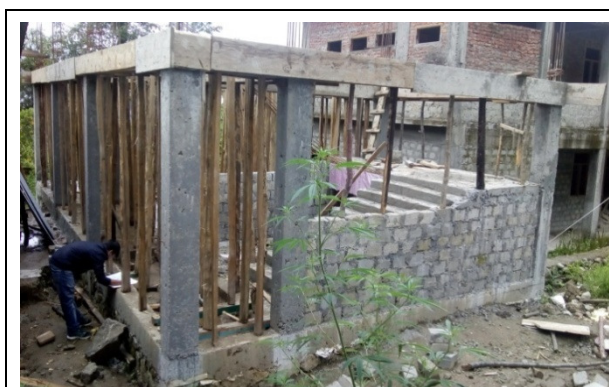
The status of the work 'Rostrum at Seru Secondary School' shown to have been completed in March 2017.