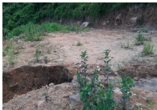
The deplorable condition of ‘Playfield at Kodokha (Takiomporing)’.