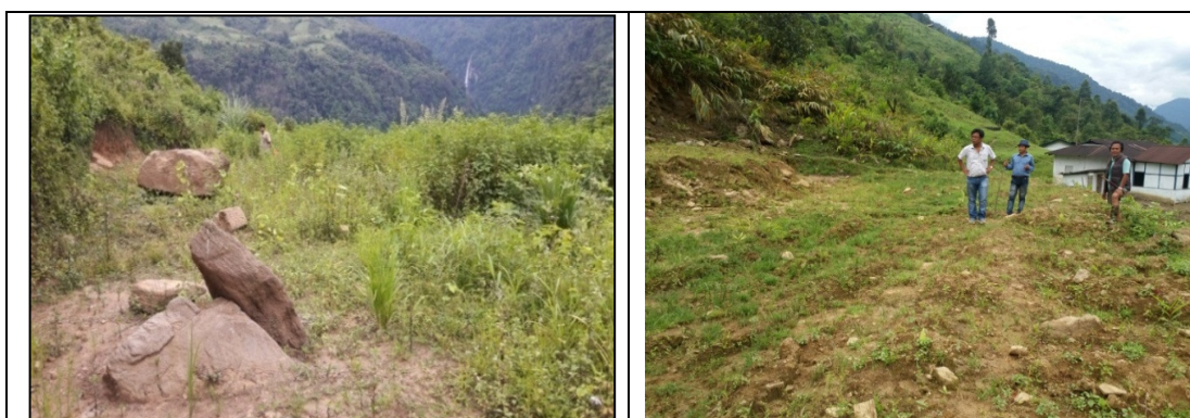
‘Playground at Karam Primary School’ and ‘Playground at Doginalo Primary School’ were not in playable condition.