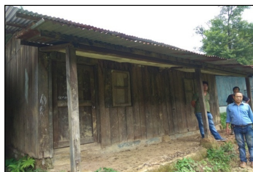
The dilapidated condition of 'Teachers Quarter at Ragmi Primary School' constructed at the cost of ₹ 15.00 lakh.