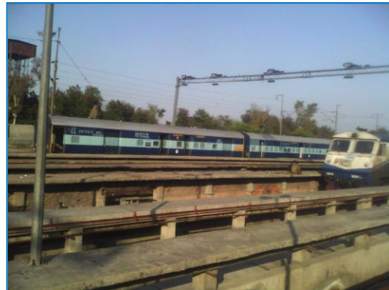
Fig 1.1: Washing pit line

Route Relay Interlocking (RRI) is the system used in large and busy stations that handle large number of trains. In this system, an entire route through the station can be selected and all the associated points and signals along the route can be set at once