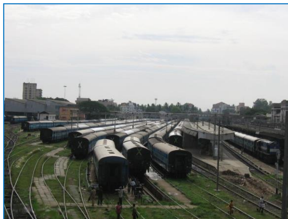
Fig 1.3: Railway Yard

A railway yard is a complex series of rail track for storing, sorting or loading/unloading of trains. Rail yards have many tracks in parallel for keeping rolling stock stored off the mainline, so that they do not obstruct the flow of traffic. Yard remodelling work may include the works of interlocking of tracks with latest technology, capacity enhancement etc. This place can also be used for washing, repairs and maintenance of coaches.