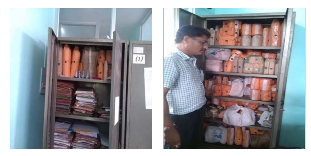
Photograph-3.2 & 3.3 Food samples stored in steel almirah in Kamrup (Metro) district