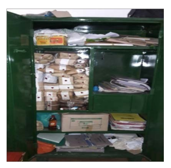
Photograph-3.1Food samples stored in an almirah in Kangra district

The Ministry accepted (June 2017) the facts.