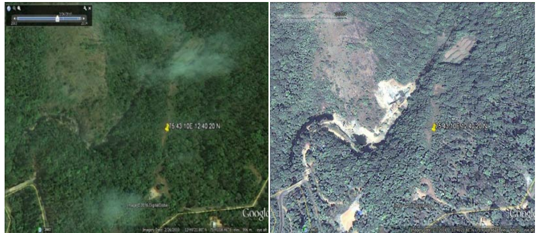
Fig 5.2: (a) Imagery dated 26/2/2010 of the site; (b): Imagery dated 7/2/2014 of the site

The matter was taken to the Karnataka High Court which ordered (June 2014) for obtaining necessary approval for diversion under FC Act. In reply, the PCCF -WL stated that the PCCF- Head of Forest Force (HoFF) is seized of this issue, the wildlife wing in close association with PCCF-HoFF would follow up this case scrupulously. It was, however, observed that the project had been commissioned in June 2016.