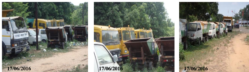
Waste disposal vehicles lying idle at Bus stand, Bartand, Dhanbad

vii) Sanitary vehicles purchased (February 2013) by the firm for Dhanbad at a cost of ₹ 4.75 crore remained unutilised due to failure to transfer the vehicles to ULB Dhanbad.