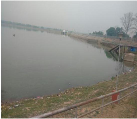
Kanke dam (Design Capacity-19.50 MLD) (19/03/2017)

have been interlinked as per their capacity and technical feasibility to the nearby population of other zone. EIC further stated that Rukka reservoir is linked with Hatia and Gonda areas as the live storage of Rukka reservoir can meet the partial demand of Hatia and Gonda areas.