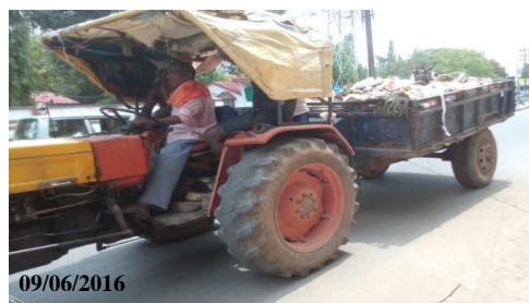
MSW carrying through open vehicle in Deoghar

The MSW Rule (Schedule II) specified activities to be undertaken by municipalities to ensure that transportation of MSW for processing/disposal takes place in a hygienic manner and does not cause littering of waste.