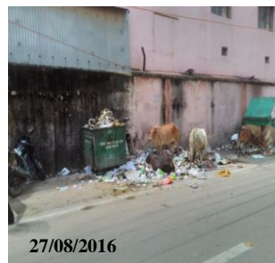
Garbage littered from waste bin at Lalpur, Ranchi

Audit also conducted physical verification of sites under the sampled ULBs and found that in many places MSW was dumped in open spaces on the roadside and even burnt openly as shown in the photos below: