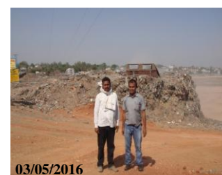
MSW dumped beside the river at Medininagar

Thus, disposal of waste was being carried out in an unscientific and unhygienic manner in open or beside river thereby causing unsanitary conditions and pollution.