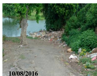
MSW dumped beside the river at Sahibganj