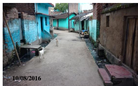
Silt deposited in drain, near Railway Station, Sahibganj

Thus, absence of adequate drainage and sewage treatment system prevented disposal of domestic sewage in test checked ULBs.