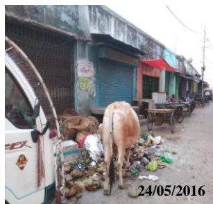
Garbage kept in open beside the road at Peda Gali Deoghar