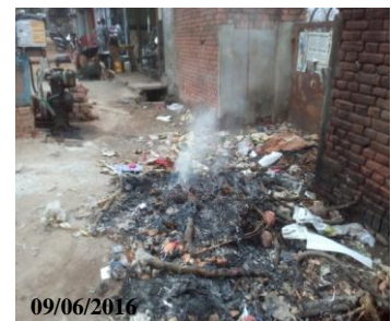
Garbage burnt beside the road at Masjid Chowk Deoghar