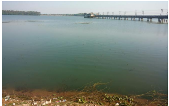
Rukka dam (Design Capacity-170.50 MLD) (14/03/2017)

of the Master Plan of Ranchi by the State Government in which it is mentioned that all the three dams have been interconnected. However, Engineer-in-Chief (EIC), DW&SD stated (20 March 2017) that these dams