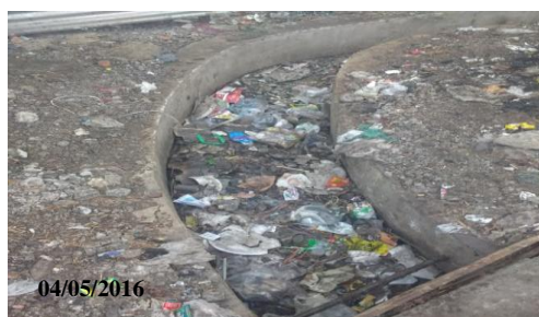
Open drain choked by garbage at Bhuiyandih, Jamshedpur

Due to lack of piped sewer system, waste water generated in test checked ULBs could not be processed and utilised