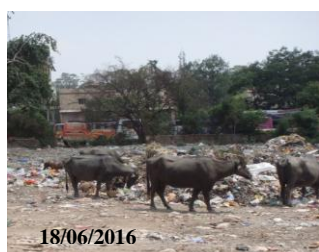
Open Landfill site at Dhanbad