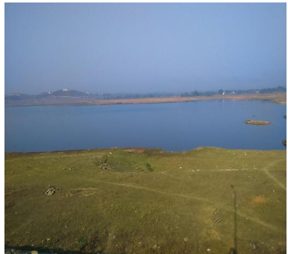
Hatia dam (Design capacity-56.83 MLD (14/03/2017)

Thus, the objective of interconnectivity of dams to ensure uninterrupted supply of water to the residents of Ranchi were partially met by connecting Rukka reservoir with catchment areas of other two dams while rationing of water from Hatia dam continued unabated besides having inadequate water supply, irregular supply of water without adequate pressure, etc. in many parts of the city especially under the catchment area of Hatia dam.