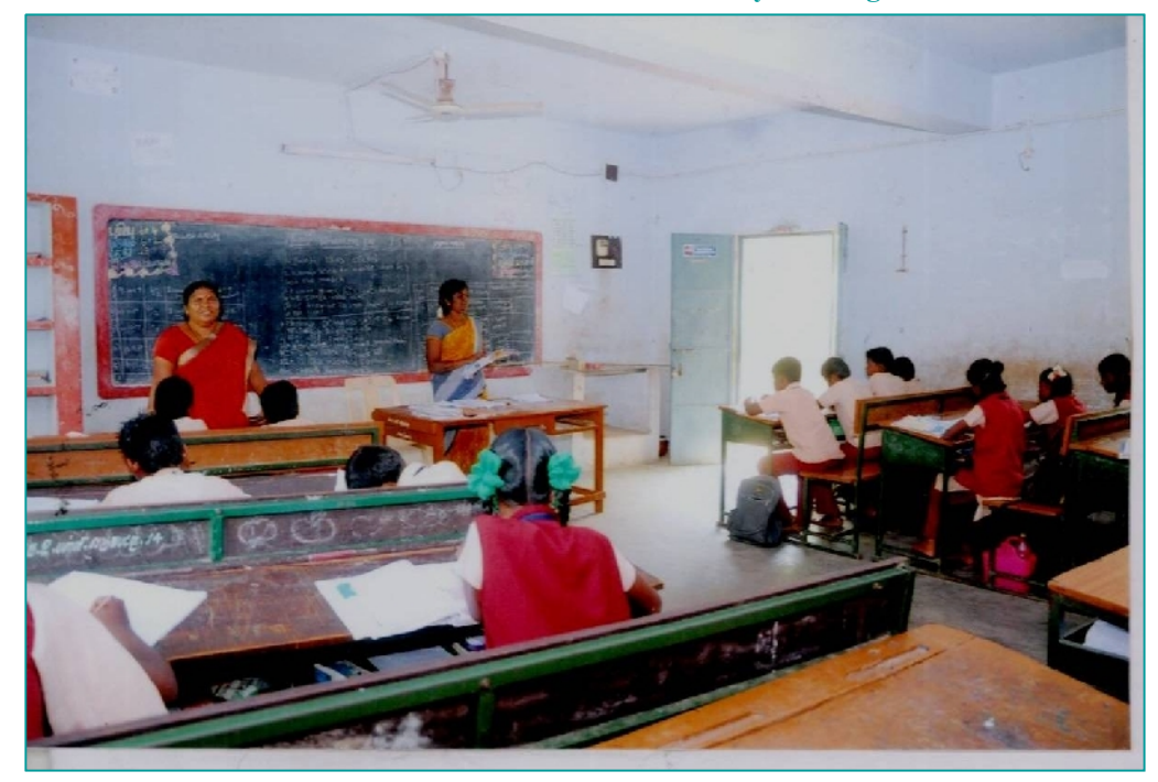
Exhibit 3.3: Two classes conducted simultaneously in a single class room

revenue records and hence, the District Collector declined to alienate those lands. The matter was still under correspondence with Revenue Department.