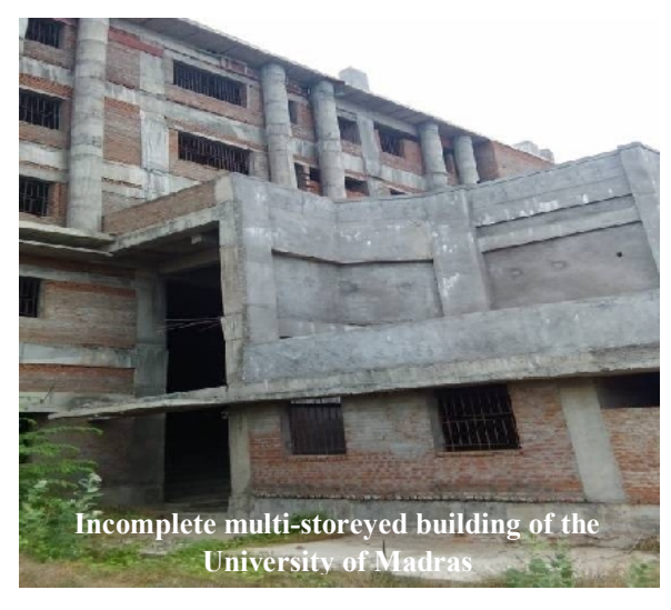
Exhibit 3.6: Physical and financial status of the building