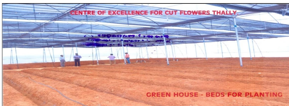
Completed Green House without plantations

NHM guidelines, 2010 (Para 8.22) provided for selection of variety of construction material 20 for green houses with different rates of subsidy 21 to enable beneficiaries to select variety of locally available construction materials.