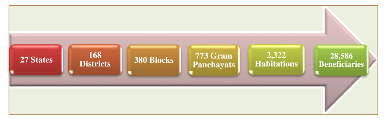
Chart-1.1: Sample size

The sample size covered during the performance audit is depicted in Chart-1.1 :