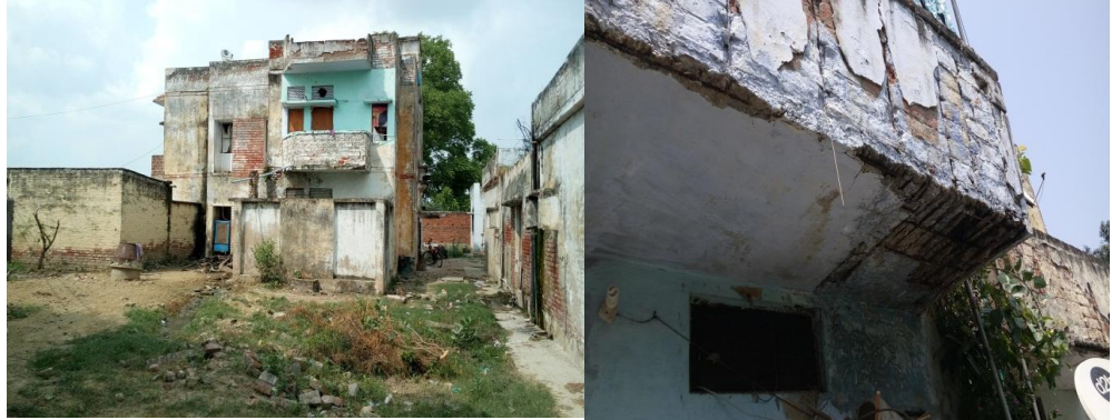
Dilapidated condition of residences at Police Station, Bithur Kanpur

In test-checked districts, the availabilities of residential houses were only 5,729 (14 per cent ) against the available manpower of 42007. Further, the position of residential houses in test-checked police stations was also similar with availability of only 22 per cent (817 against the available manpower of 3,604); housing to police personnel. Availability of housing in test-checked districts and police stations are given in ( Appendices 10.8 & 10.9 ). The condition of the houses was also not satisfactory as given in pictures below.