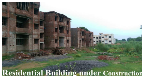
Residential Building under Construction

There is an acute shortage of residential accommodation in all categories despite the fact that this requirement has been assessed on the basis of present working manpower (49 per cent of sanctioned strength) in state police force instead of sanctioned strength.