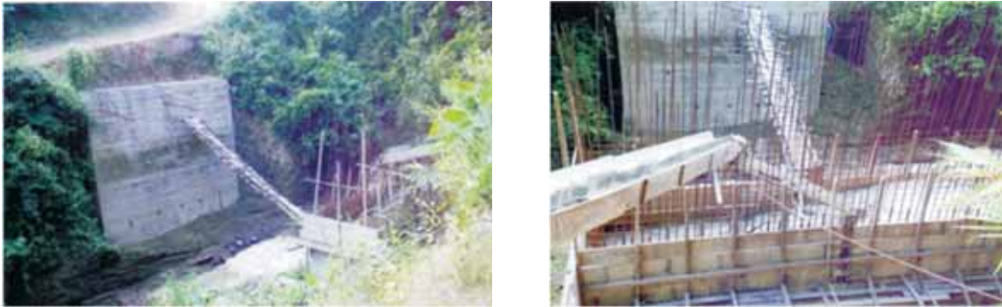
Progress of construction of BUG Bridge over River Samuksury as on 04 December 2015

Joint physical verification of the work was conducted by audit (4 December 2015) in the presence of the Executive Engineer, PWD of the Council. This revealed that out of two abutments only one abutment was completed, leaving construction of Wing Walls and Slab. Photographic evidence of physical progress exhibits that the work was far from completion.