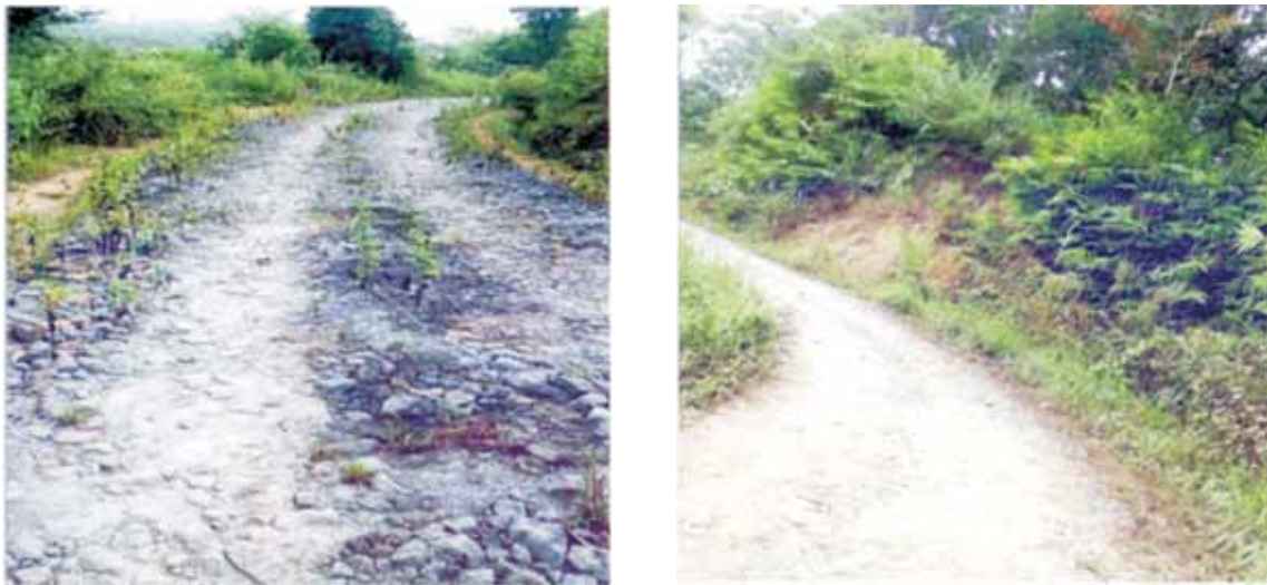
Progress of SMBT Road from Udalthana to New Secretariat as on 4 December 2015

Joint Physical verification of the work conducted by audit (4 December 2015) in the presence of the Executive Engineer, PWD of the Council revealed that as of December 2015 the contractor had completed only three components of the work (Kutchra side drains, Protection works and Drainage work) leaving pavement work, which was in progress with laying boulders. Photographic evidence taken during joint physical inspection shows that pavement work was not completed.